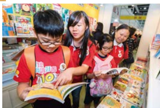
Group volunteers accompany students to buy books at the book fair 集團義工陪伴學童在書展選購心愛書籍