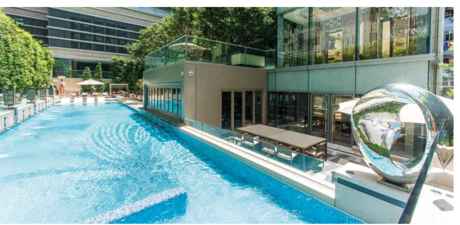
Clubhouse 20-metre outdoor pool and jacuzzi 會所設有全長20米的露天游泳池連按摩池