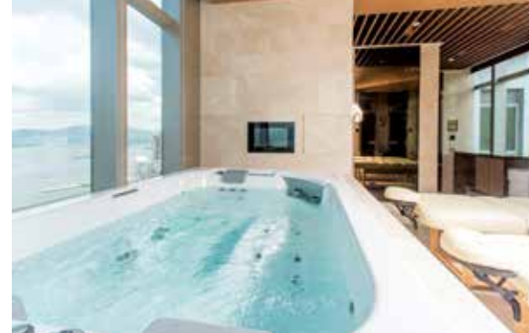
Hotel-style spa and massage available in the clubhouse 住客可享用會所的星級酒店水療按摩服務

Imperial Kennedy provides prestigious property management and concierge services including dinner and meal kits delivery, home cleaning and maintenance and even leasing management and key custody.