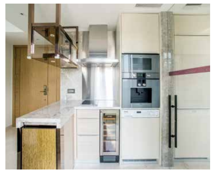
Deluxe European kitchen appliances 厨房配備高級歐洲品牌電器

Imperial Kennedy為住客提供全面的星級物業管理及禮 賓服務,包括代訂餐飲及煮食材料、家居清潔及維修, 以至租務管理及鎖匙保管服務等。