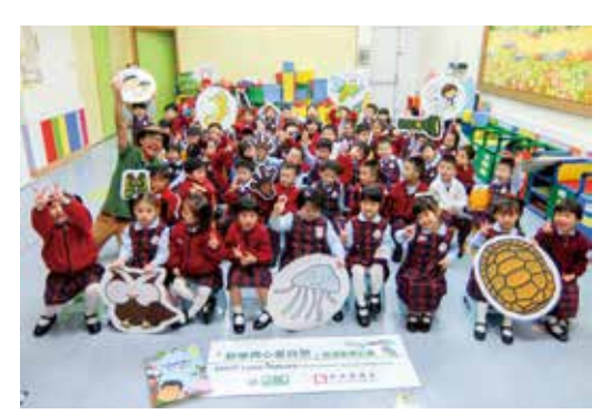
Dr Nature On-The-Go kindergarten visit for children 特別為幼童而設的「自然博士進校園」計劃訪校活動

由集團全力支持,綠色力量舉辦的「新地齊心愛自然」計劃今年邁進五周年。活動結合學習與欣賞、戶外探索等不同元素,旨在培育學生愛護自然,鼓勵他們與家人攜手愛護環境。該計劃自2011年展開以來,舉辦了不同活動,包括海岸及郊外清潔、訪校、生態學習之旅、繪畫比賽及展覽等,將保育訊息帶到小學及幼稚園,並為教師提供培訓及教材。五年來,共有近三萬名學童透過該計劃的生動有趣活動,認識愛護自然的重要性。