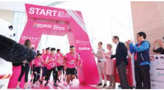
Some 1.700 vertical run enthusiasts in this vear's Race to Shanghai IFC