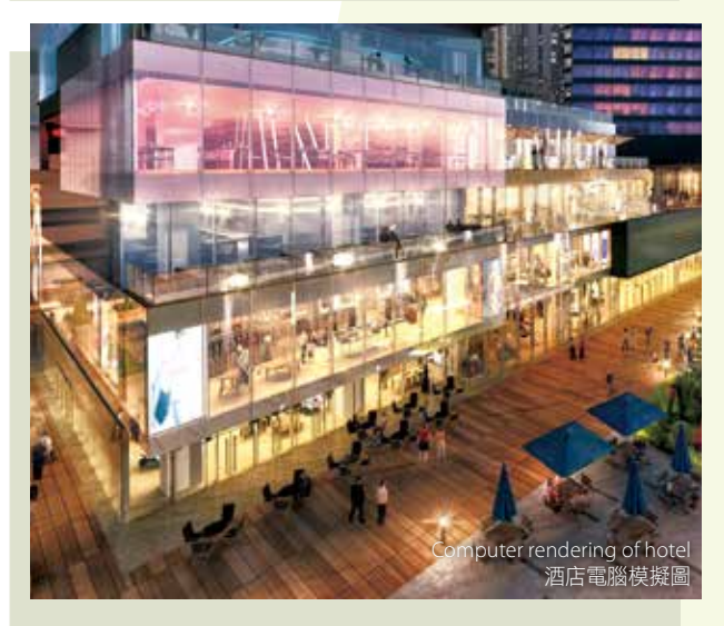
Harbourfront hotel site offers the privilege of sea views from most rooms