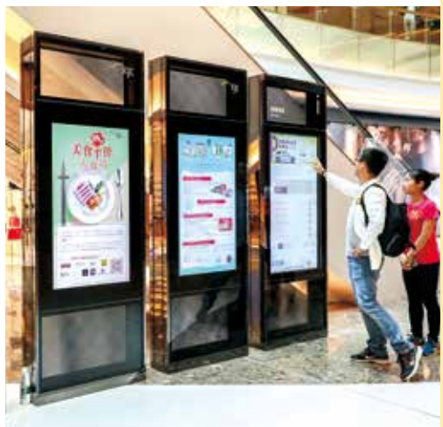
e-directories and e-table booking systems for customer convenience