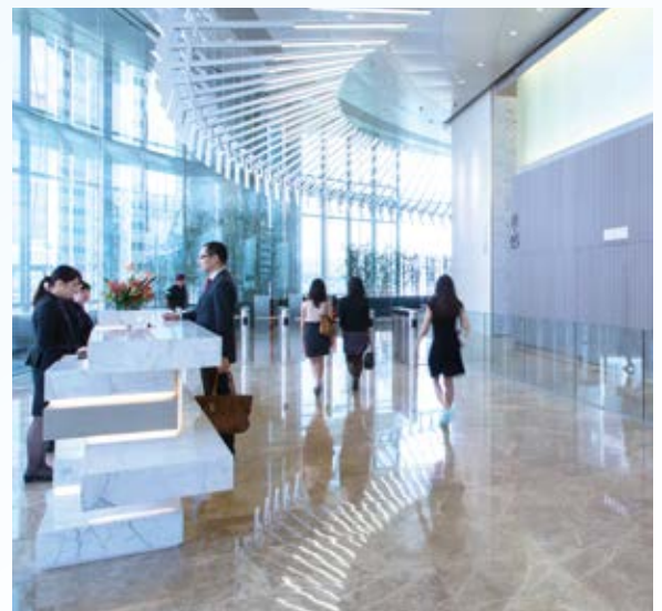
Multinational financial institutions prefer IFC 國際金融中心寫字樓備受跨國金融機構歡迎

The complex contains about 2.5 million square feet of prime grade-A offices with features and management that supersede most grade-A office buildings. The artificial intelligence building design, energy management and business continuity plans ensure a comfortable, steady working environment for tenants, which is particularly crucial to financial institutions that operate 24 hours a day. Top-notch investment banks and financial institutions have chosen ICC as their business address since completion, making it an extension of Central. It is now