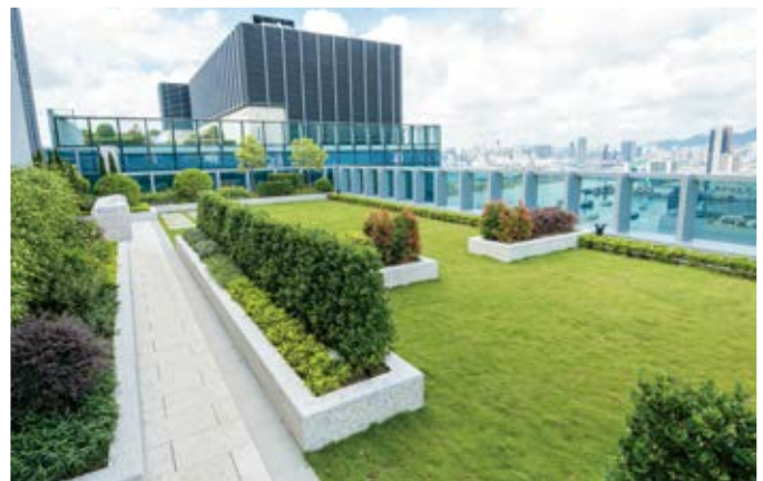
Sky garden at Two Harbour Square Two Harbour Square空中花園

由集團合資發展，位於觀塘的全新寫字樓項目Two Harbour Square將於本年底全面落成啟用。另外，觀塘巧明街98號項目將發展為總樓面面積約120萬平方呎的商業項目，其中大部分為甲級寫字樓，餘下部分為商場，以行人天橋連接創紀之城第六期，勢將產生協同效應。