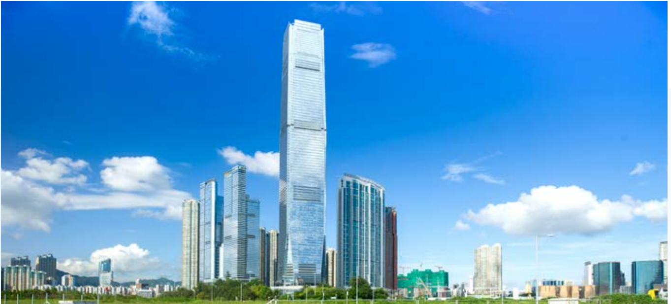
ICC is the tallest building in Hong Kong, with offices, a shopping centre, hotels, serviced suites and an indoor observation deck 環球貿易廣場為本港最高建築物，匯聚寫字樓、商場、酒店、服務式套房酒店及室內觀景台