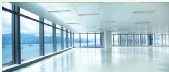
Two Harbour Square features 28,000-square-foot floor plates and unrivalled sea views Two Harbour Square樓層面積約達28,000平方呎，盡享廣闊海景

Two Harbour Square採用玻璃幕牆，大堂選用天然石材配合垂直綠化牆，設計簡約時尚。項目配套齊全，天台設有空中花園，讓租戶可以忙裡偷閒，舒展身心。大廈預留約30,000平方呎作食肆及零售之用，體貼行政人員的日常需要。停車場共設四層，提供超過180個泊車位，方便駕車人士出入。