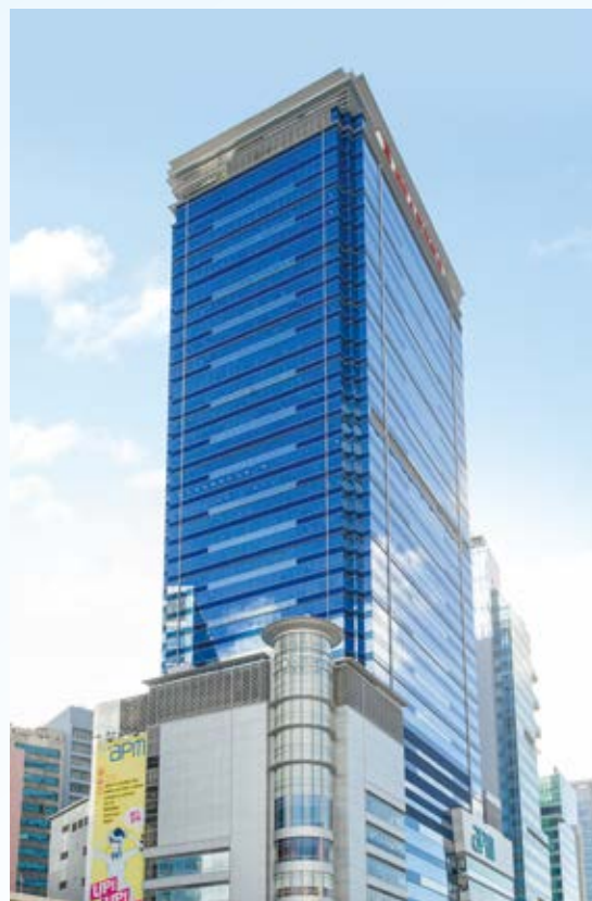
Single ownership of Millennium City offers higher flexibility than other options in the area

整個項目的甲級寫字樓樓面，以國際級規格設計，配備先進設施，加上前臨維港景致，多年來深受跨國金融機構歡迎。項目出租率維持高企，現時接近全部租出，租金表現理想，續租租金持續上升。