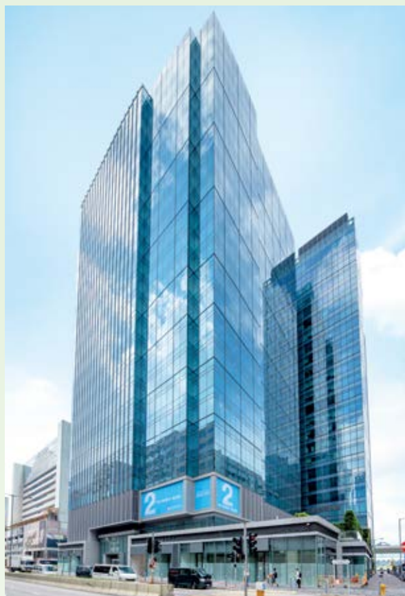
Two Harbour Square opening by year end Two Harbour Square將於今年底落成啟用

Two Harbour Square提供20層甲級寫字樓，每層寫字樓面積約28,000平方呎，尤其適合需要使用大型空間的租戶；標準樓層樓底淨高約2.75米。頂層特色樓層樓底淨高約3.2米，並擁有專屬的特色露台。項目與毗鄰同屬集團發展的One Harbour Square共同享有廣闊海景，臨海景觀一覽無遺。租戶可於樓層飽覽郵輪碼頭以至維港迷人景致。