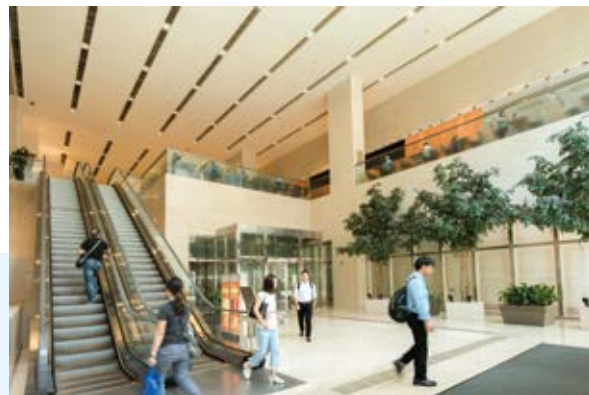
Millennium City is close to MTR stations for easy access 創紀之城毗鄰港鐵站·交通方便