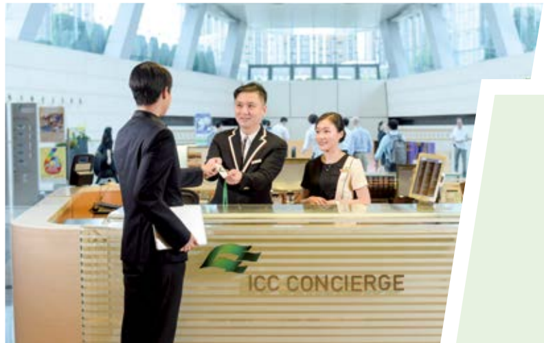
Professional, caring management provides premium service to office tenants and visitors 寫字樓物業由專業細心的物業管理團隊駐守，為租戶及訪客提供優質服務