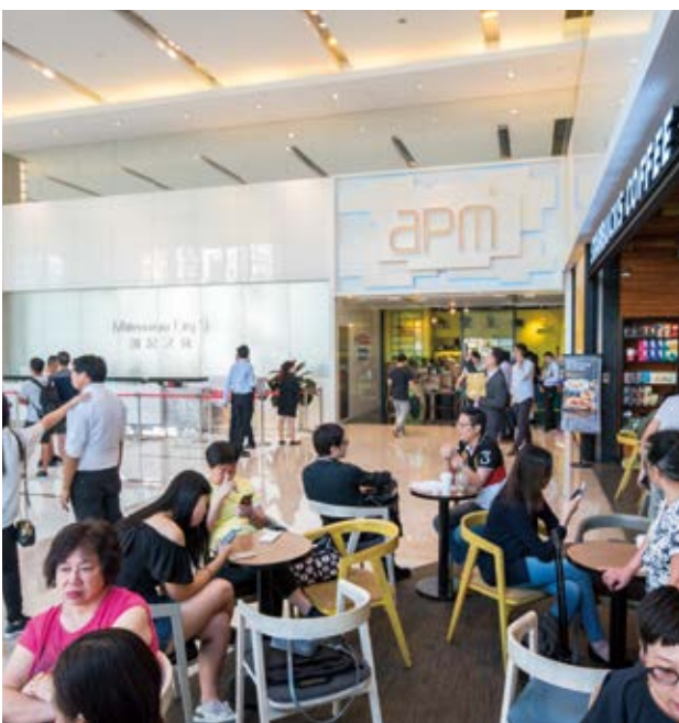
Most office buildings have restaurant and retail floors for tenants' convenience 為方便租戶日常需要，大部分寫字樓物業均設有餐飲及零售樓層

儘管未來數年，區內全新甲級寫字樓供應將繼續大幅增加，但創紀之城憑著多方面的優勢，租務表現預期依然向好。這個商廈群設施優質，管理完善，樓層面積較大，實用率亦高，加上業權由集團單一持有，可靈活配合租戶的業務需要，亦方便有意租用較大樓面面積的準租戶。創紀之城一期、二期、五期及六期的出租率維持在高水平，租金增長令人滿意。