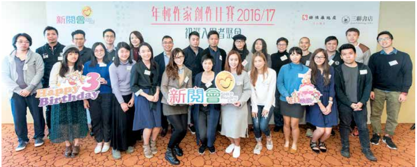
2016/17 Young Writers' Debut Competition judges meet finalists and offer writing tips 「年輕作家創作比賽2016/17」入圍者與評審會面，請教創作心得