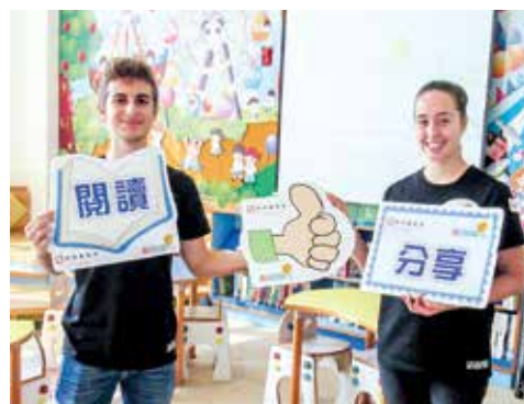
AFS Intercultural Exchange participants describing their cultures to students in the Read & Share school programme AFS國際文化交流計劃的海外交流生在「閱讀·分享」學校推廣計劃活動中，向學生介紹自己國家的文化

新閱會與香港資助小學校長會合辦的「閱讀·分享」學校推廣計劃，新一年活動已經全面展開。今年主題為「童詩同see大世界」，以不同形式的到校活動，讓學生領略閱讀的樂趣，包括工作坊鼓勵學生創作兒童詩歌，作家及愛書人講座分享他們的故事及見聞等。