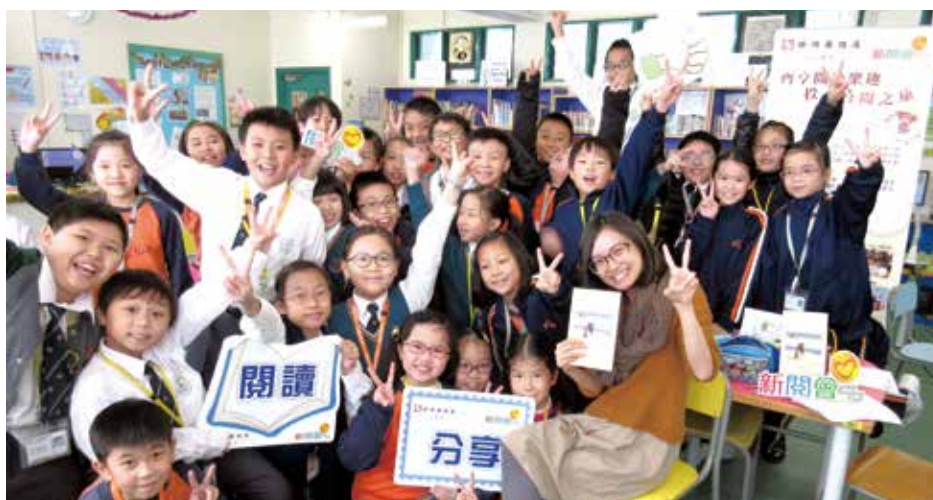
Read & Share school programme seminars and creative workshops encourage primary students to read more 「閱讀·分享」學校推廣計劃定期到訪各區小學，舉辦作家分享及創意工作坊等活動，鼓勵學生多閱讀