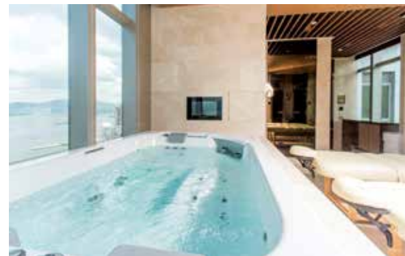
Hotel-style spa and massage available in the clubhouse 住客可享用會所的星級酒店水療按摩服務

Imperial Kennedy provides prestigious property management and concierge services including dinner and meal kits delivery, home cleaning and maintenance and even leasing management and key custody.