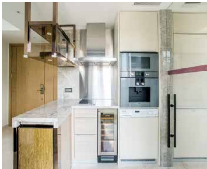
Deluxe European kitchen appliances 廚房配備高級歐洲品牌電器

Imperial Kennedy為住客提供全面的星級物業管理及禮賓服務，包括代訂餐飲及煮食材料、家居清潔及維修，以至租務管理及鎖匙保管服務等。