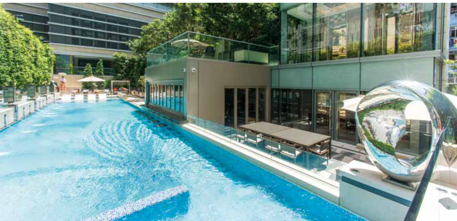
Clubhouse 20-metre outdoor pool and jacuzzi 會所設有全長20米的露天游泳池連按摩池