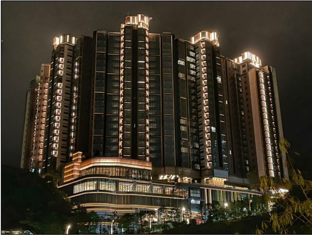
St Michel is on the mid-levels of To Shek Street, Sha Tin. It is near Tate's Cairn Tunnel, Lion Rock Tunnel and the MTR Sha Tin Wai and City One stations.