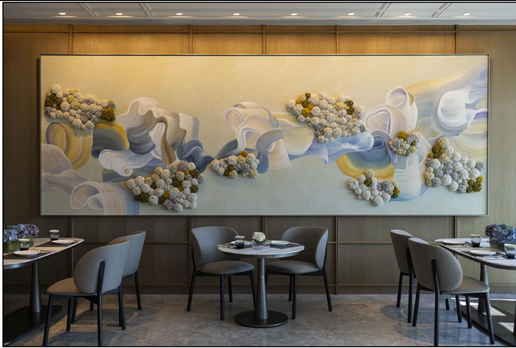
Club Michel, the clubhouse of St Michel, was designed by renowned Japanese interior design firm Strickland and has many modern aesthetic features.