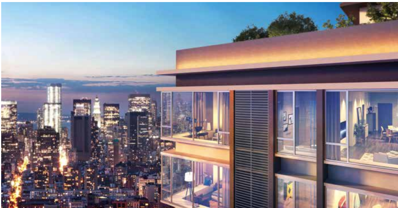
The Arch Suites boutique residences 天峻定位为精品住宅

集团占40%权益的成都环贸广场，为大型综合发展项目，总面积达130万平方米（1,400万平方呎），汇聚高级住宅、优质写字楼、零售楼面及五星级酒店于一身。项目毗邻二环路东段，位于成都地铁东大路站上盖，地理条件优越。