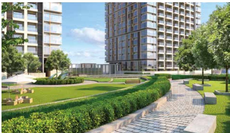
Premium living environment at The Arch Suites 天峻居住环境优越

天峻坐落于120,000平方米（130万平方呎）的商业楼面之上，为住户带来购物、餐饮及休闲便利。项目作为成都地铁东大路站上盖物业，住户可乘搭成都地铁二号线前往市内各主要区域，待在建中的八号线通车后，更可在该换乘，尽享配套完善的都会生活。