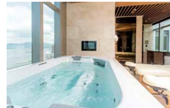
Hotel-style spa and massage available in the clubhouse 住户可享用会所的星级酒店水疗按摩服务

Imperial Kennedy provides prestigious property management and concierge services including dinner and meal kits delivery, home cleaning and maintenance and even leasing management and key custody.