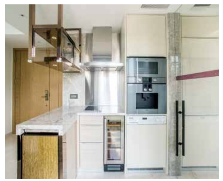
Deluxe European kitchen appliances 厨房配备高级欧洲品牌电器

Imperial Kennedy为住户提供全面的星级物业管理及礼 宾服务,包括代订餐饮及食材、家居清洁及维修,以至 租务管理及钥匙保管服务等。