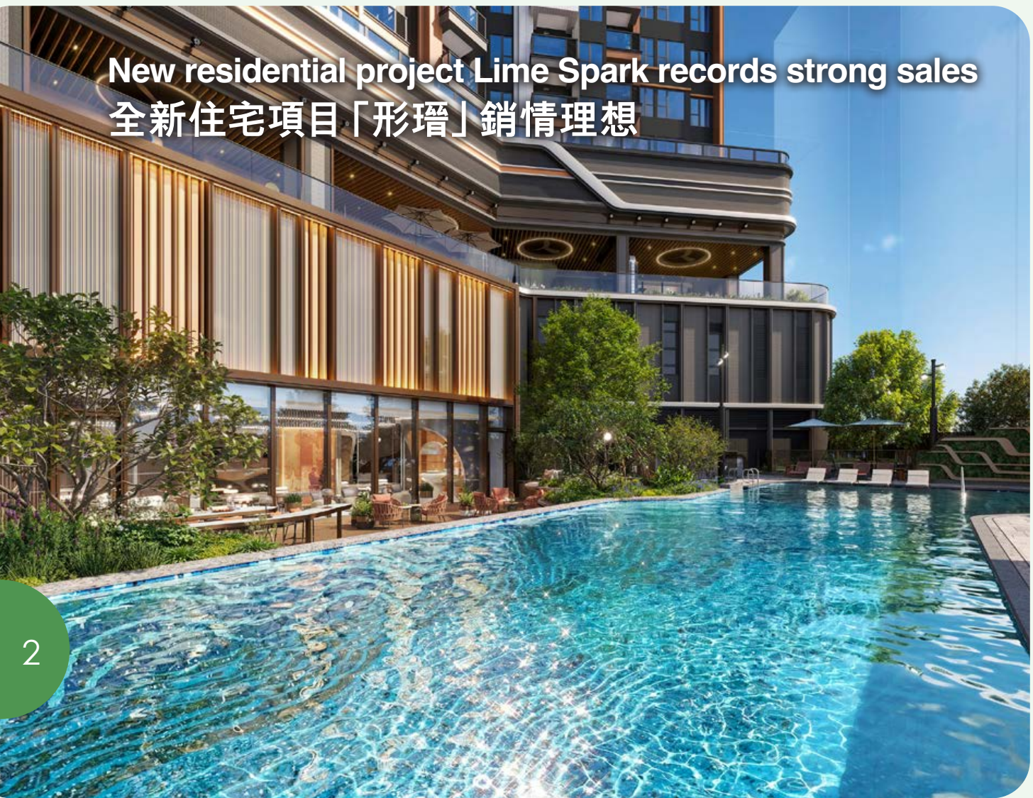
23-metre outdoor swimming pool 2 (rendering 3 ) 長約23米的室外泳池 2 (模擬效果圖 3 )

D eveloped by Sun Hung Kai Properties (SHKP), Lime Spark (the Development) is a premier residential development located in the heart of Tsuen Wan. Offering excellent connectivity via “three stations across two lines” 1 on MTR and premium clubhouse facilities 2 , the Development introduces premium accommodation in this established neighbourhood. Since its launch, Lime Spark has received encouraging market responses across multiple sales rounds.