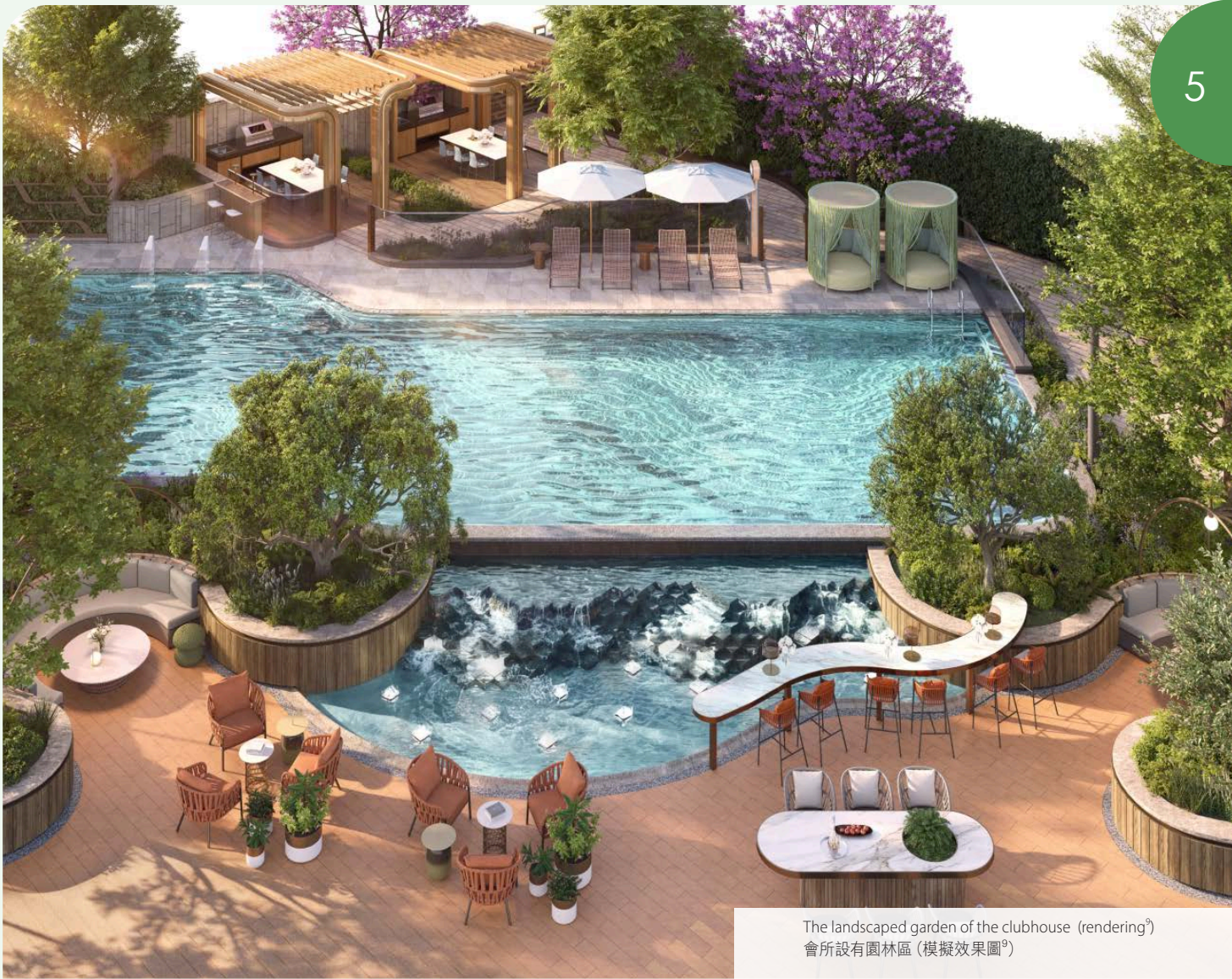
The landscaped garden of the clubhouse (rendering 9 ) 會所設有園林區 (模擬效果圖 9 )