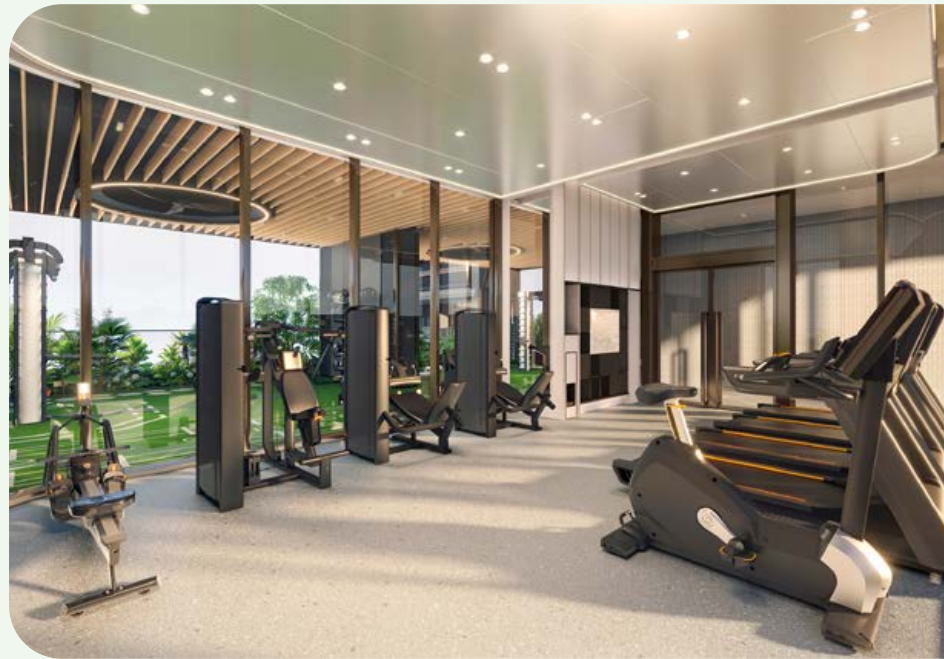
The indoor Vitality Gym 2 (rendering 9 ) 動感健身區 2 (模擬效果圖 9 )

此外，項目毗鄰有蓋天橋 5 ，接駁荃灣完善的天橋網絡，通往區內八大商場 6 、時尚旗艦店及超市等。項目更位處小學校網62及荃灣中學校區 7 ，優質學府林立，完善配套滿足住戶生活所需。