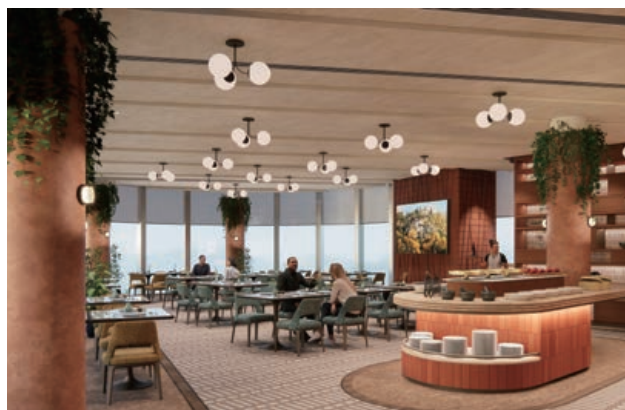
Italian dining Ponentino 意大利餐厅 Ponentino

帝苑酒店集团总经理陈淑贞表示：“我们很高兴成立44周年的帝苑酒店，能在此时拓展品牌版图。新酒店延续我们对卓越服务的承诺，多元化的设施融入自然风格设计，为旅客提供宁静悠闲的现代都市度假新体验，满足家庭、商务及度假旅客的需要。”