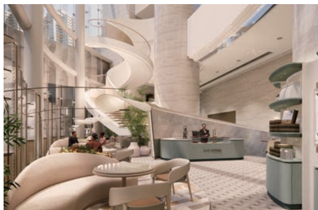
The Fine Foods Lounge 大堂的 The Fine Food Lounge

餐饮方面，酒店顶楼的意大利餐厅 Ponentino 将于2026年7月开幕，店内特设户外露台，可饱览将军澳景致。康体休闲设施包括25米室外泳池、健身室、现代化会议及婚宴场地。大堂的 The Fine Foods Lounge 将供应帝苑酒店经典蝴蝶酥及其他招牌糕点美食。