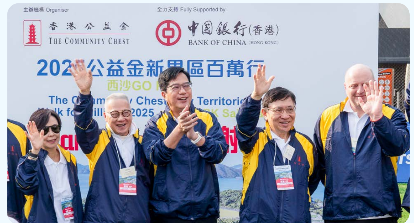
The Group served as the venue sponsor for the Community Chest New Territories Walk for Millions, which took place at GO PARK Sai Sha in mid-February. The event attracted thousands of participants, including representatives from various companies and local organizations. Participants took part in a 1.5-km charity walk along the cycling and running track at GO PARK Sports. Officiating the starting ceremony are Michael Wong (third left), Deputy Financial Secretary, Raymond Kwok (second right), SHKP Chairman and Managing Director and other guests 集團提供西沙 GO PARK 作為二月中「2025 公益金新界區百萬行」的活動場地，當日吸引數千人參與，包括工商機構和地區團體。參加者沿著 GO PARK Sports 的單車/跑步徑步行，全場距離約 1.5 公里，場面熱鬧。圖為財政司副司長黃偉綸（左三）及新地主席兼董事總經理郭炳聯（右二）等主持活動起步禮

In line with SHKP's philosophy of Building Homes with Heart, the project is designed to cater for the diverse lifestyles of all age groups, from its overall planning to facilities. Recognizing the modern family's emphasis on children and pets, GO PARK Sai Sha features numerous family- and pet-friendly facilities, making it an ideal destination for parents and children to spend quality time together, along with their pets.