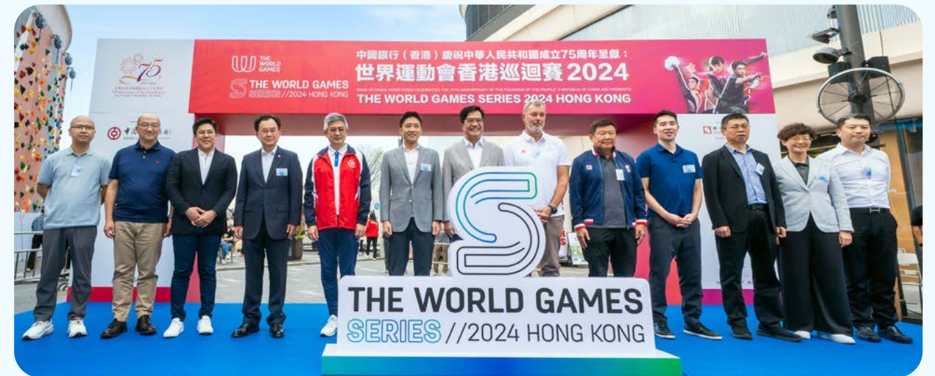
GO PARK Sai Sha hosts the first Hong Kong series of The World Games, contributing to Hong Kong's development as a city of major international sports events. 西沙 GO PARK 為世界運動會首個香港巡迴賽的主辦場地，助香港發展成國際體育盛事之都。

項目亦引進了多間商戶，涵蓋運動消閒和餐飲娛樂，包括劍擊學校、戶外攀石場等，而全天候室內泳池，則由香港游泳學校提供恆常課程。至於擁有一流設備的多用途室內