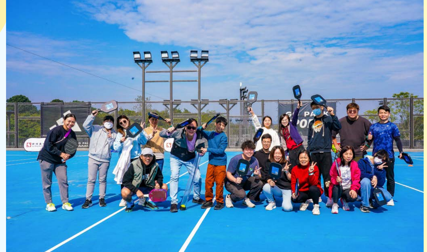
In mid-December 2024, the Group welcomed around 70 mentors and mentees from the Strive and Rise Programme to GO PARK Sai Sha to experience emerging sports. SHKP is a strategic partner of the Strive and Rise Programme, for which over 200 employees volunteering as mentors for two consecutive terms. The Group has continued its involvement in 2025, with over 220 employees signing up as mentors. 集團於2024年12月中旬，安排70名共創「Teen」計劃的師友到西沙GO PARK，體驗多項新興運動。新地是該計劃的策略夥伴之一，已連續兩屆有逾200名新地員工擔任友師，而2025年的新一期計劃亦有逾220名員工報名參加。

Furthermore, GO PARK Sports collaborates with multiple sports associations, federations and organizations to offer courses and provide professional training, promoting sports in the community. The park is now officially open for public booking of classes, personal coaching, events, and facilities via the GO PARK Sports App and website.