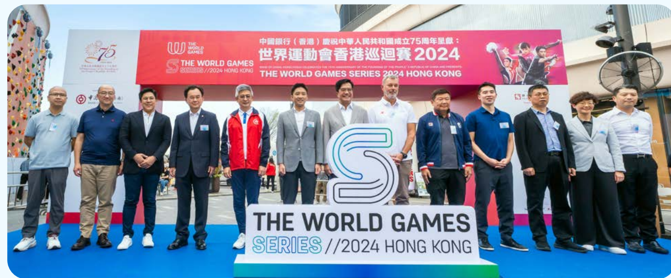
GO PARK Sai Sha hosts the first Hong Kong series of The World Games, contributing to Hong Kong's development as a city of major international sports events. 西沙 GO PARK 为世界运动会首个香港巡回赛的主办场地,助香港发展成国际体育盛事之都。

西沙 GO PARK 设有共占地逾 3,716 平方米 (40,000 平方呎) 的三大儿童游乐区,配备多款有助激发儿童发展潜能的游乐设施,另外配备逾 278.7 平方米 (3,000 呎) 的宠物公园,以照顾毛孩的需要。