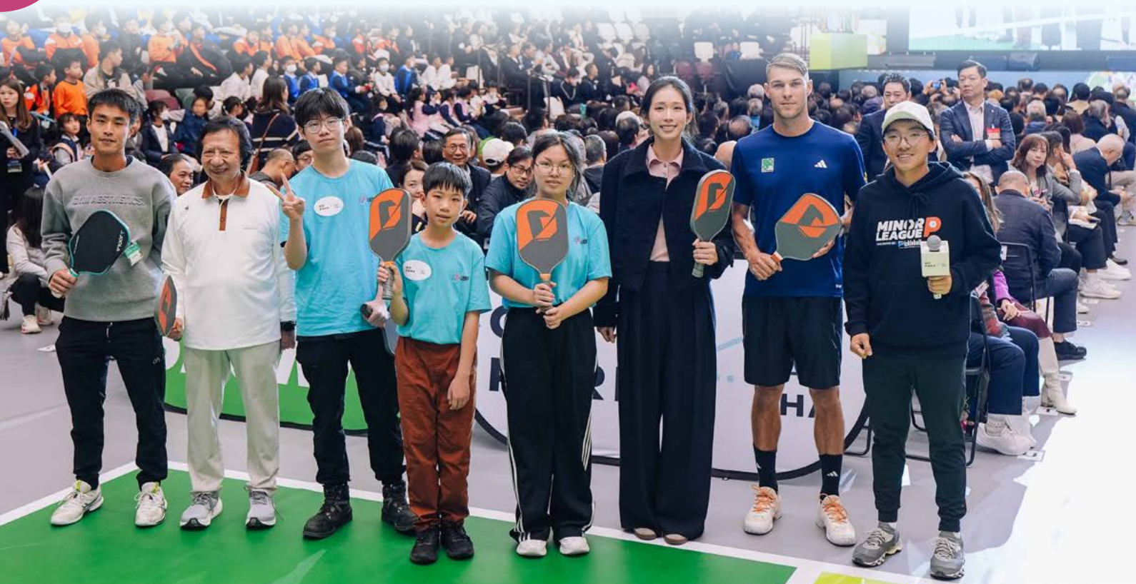
Olympic gold medal-winning fencer Vivian Kong (third right) and Senior Director of Sun Hung Kai Real Estate Agency Limited Thomas Kwok (second left) experience the exciting new sport of pickleball with Strive and Rise mentees. 奥运剑击金牌得主江旻憓(右三)、新鸿基地产代理有限公司资深董事郭炳江(左二)与共创明「Teen」计划学员在西沙GO PARK开幕日试玩新兴运动匹克球。

To enhance the transport infrastructure in Sai Sha, SHKP widened 1.5 kilometres of Sai Sha Road from a single two-way carriageway to a dual two-way carriageway, doubling its capacity to meet the future development of the community. Multiple new bus and minibus routes connecting the project to various districts are also introduced, including new bus routes to the nearby MTR Wu Kai Sha station and MTR University station, further enhancing the transportation network. GO PARK Sai Sha also has a parking lot for car users.