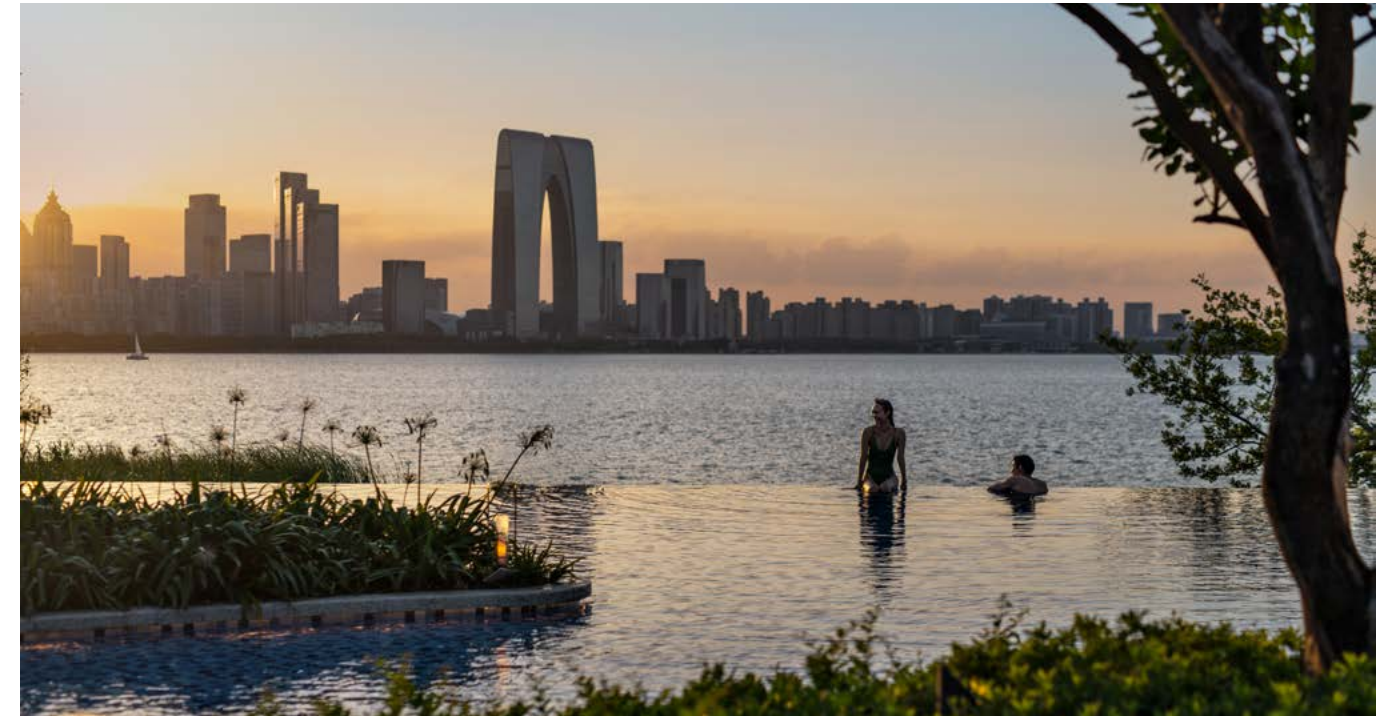
The outdoor infinity pool resonates with Jinji Lake, providing a captivating view 戶外無邊際泳池與金雞湖面相互輝映，景色醉人