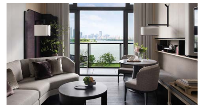
Four Seasons Hotel Suzhou features exquisitely designed rooms with garden and lake views 蘇州四季酒店的房間設計高貴典雅，坐擁優美的園景和湖景景色