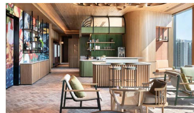
"Flavour Lounge", an ideal venue to cook up a storm for yourself or for friends using high-end kitchen supplies 「共享廚房」配備高級廚房用品，讓您或好友盡享烹飪樂趣的理想場地

項目特設覆蓋面積近53,000平方呎、融合商務及社交乘式生活方式的「TP SOCIAL CLUB」，所有住客可享專屬通行。項目設有優越設施和社交空間，例如可俯瞰維港的天台無邊際泳池「SKYBOUND POOL」、設備齊全的商業級室內與室外健身室—重量訓練室「BEAST STUDIO」及輕量訓練室「MINDFUL」，以及共享工作間「THINK TANK」、聚會空間「HIGH BAR」、共享廚房「FLAVOUR LOUNGE」和寵物空間「FURRY LANE」等，為住客的生活注入活力與靈感。