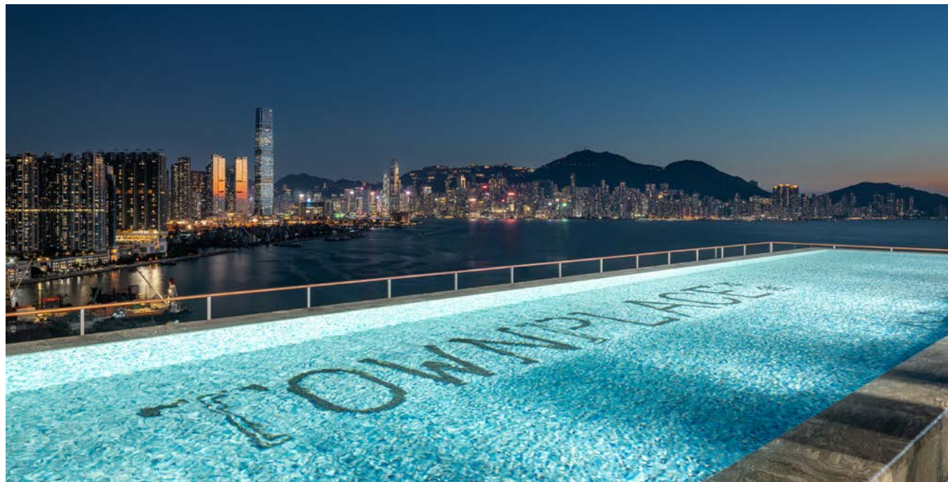
Residents can enjoy an extraordinary view of the sea and stars from the rooftop "SKYBOUND POOL". 住客可於天台的無邊際泳池「SKYBOUND POOL」欣賞海景與天際繁星

TOWNPLACE WEST KOWLOON, the all-new seafront flagship development in West Kowloon under the Group's flexible leasing brand, TOWNPLACE, has leased the first two batches of 285 units, after receiving an overwhelming response from the market. Its tenants include young local professionals, visitors to Hong Kong under the Top Talent Pass Scheme, and overseas and domestic students who have come to Hong Kong to study. In addition to its long-term apartment leasing, TOWNPLACE WEST KOWLOON announced the launch of a short-stay hotel service to provide young professionals who visit Hong Kong for business or short trips with a fully-furnished apartment, flexible leasing options and premium hotel service. The project is currently offering both short-stay hotel service and long-term apartment leasing.