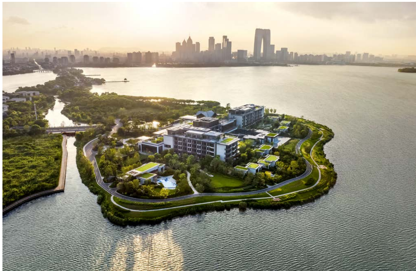
Four Seasons Hotel Suzhou is located on a private island on Jinji Lake in Suzhou, offering guests easy access to the city's vibrant business areas 苏州四季酒店位于苏州金鸡湖私密小岛上，方便住客前往繁华的苏州市中心

Located on a private island on Jinji Lake in Suzhou, the new Four Seasons Hotel Suzhou is still adjacent to the heart of the city. With a private bridge connecting to the lakeshore and easy access to the bustling business districts, as well as various leisure and cultural landmarks, guests can enjoy a luxurious island resort getaway in the heart of the city.