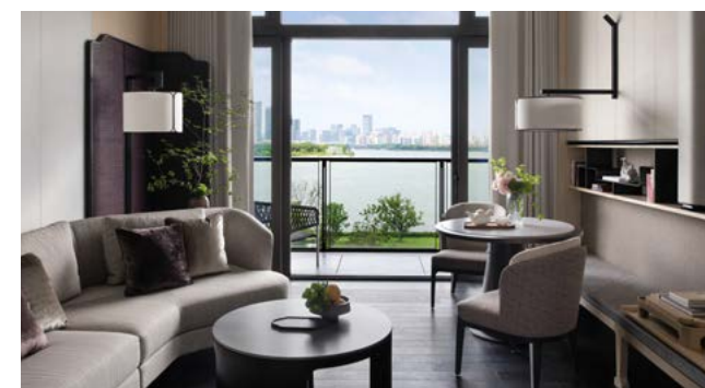
Four Seasons Hotel Suzhou features exquisitely designed rooms with garden and lake views 苏州四季酒店的房间设计高贵典雅，坐拥优美的园景和湖景景色