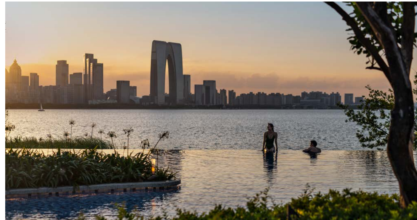
The outdoor infinity pool resonates with Jinji Lake, providing a captivating view 户外无边际泳池与金鸡湖面相互辉映，景色醉人