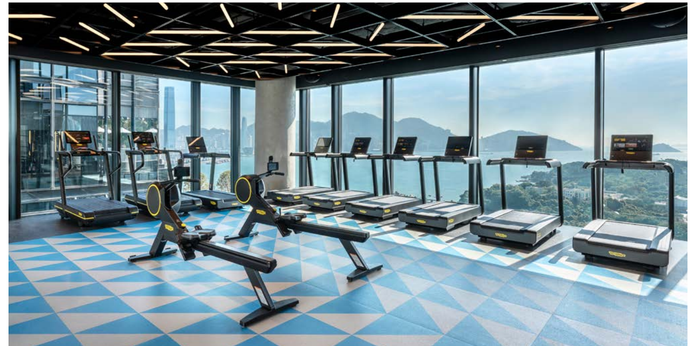
"BEAST STUDIO", a commercial grade gym, supports the fitness goals of every resident 重量训练室 "BEAST STUDIO" 拥有商业级的设备和配套助住客实现各种运动目标

TOWNPLACE WEST KOWLOON is home to TP SOCIAL CLUB, a nearly 53,000-square-foot exclusive area where connecting residents work and play together for a "Bleisure" lifestyle. The Club has excellent facilities and social areas, including the "SKYBOUND POOL", with breath-taking views of Victoria Harbour, fully equipped indoor and outdoor gyms "BEAST STUDIO" and "MINDFUL", co-working space "THINK TANK", socializing spot "HIGH BAR", and shared kitchen "FLAVOUR LOUNGE" and "FURRY LANE" for pets. Each space provides an inspiring and exciting living experience.