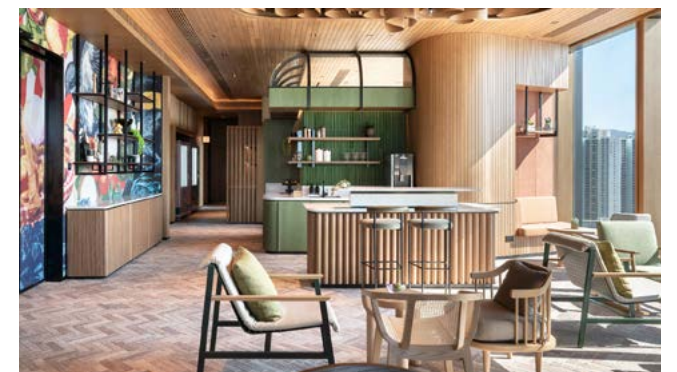
"Flavour Lounge", an ideal venue to cook up a storm for yourself or for friends using high-end kitchen supplies "共享厨房" 配备高级厨房用品, 让您或好友尽享烹饪乐趣的理想场地

项目特设覆盖面积近 4923.7 平方米 (53,000 平方呎)、融合商务及社交交叉式生活方式的 "TP SOCIAL CLUB", 所有住客可享专属通行。项目设有优越设施和社交空间, 例如可俯瞰维港的天台无边际泳池 "SKYBOUND POOL"、设备齐全的商业级室内与室外健身室——重量训练室 "BEAST STUDIO" 及轻量训练室 "MINDFUL", 以及共享工作间 "THINK TANK"、聚会空间 "HIGH BAR"、共享厨房 "FLAVOUR LOUNGE" 和宠物空间 "FURRY LANE" 等, 为住客的生活注入活力与灵感。