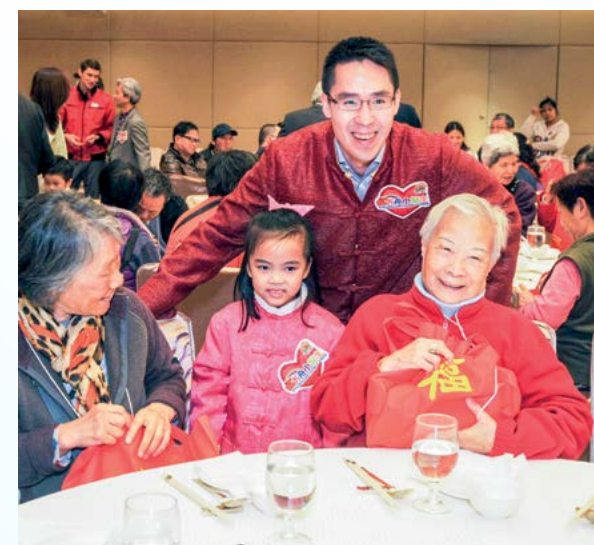
Ma Wan Park collaborates with local charity groups to organize different community activities, in which Group top management actively participates 馬灣公園與多個本地慈善集團合辦不同的公益活動，集團管理層亦積極參與其中

The construction work on Ma Wan Park Phase 2 started last year and is expected to be completed in the first half of 2024. Following the development strategy of Phase 1, which combines tourism, environmental protection and social welfare, the Phase 2 project focuses on the preservation, restoration and revitalization of most of the buildings in the old Ma Wan village. For example, the old Ma Wan village will be revitalized into an arts village, with art studios, workshops, and retail and catering places. In addition, cultural heritage, such as the Tin Hau Temple, the Kowloon customs commemorative tablet and stone tablet, and the historical Mui Wai rock inscription, will be restored. When the construction is complete, the new phase of Ma Wan Park is expected to become a popular tourist and leisure spot, preserving the unique history and culture of Ma Wan.