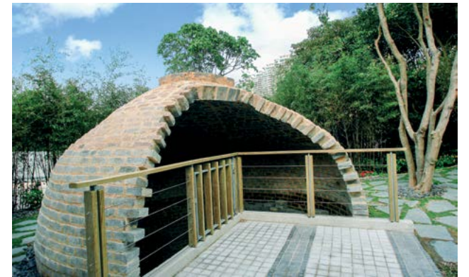
The Heritage Centre was revitalized and converted from the Fong Yuen Study Hall (Junior Fong Yuen), which was built in the 1950s. It displays some of the historical relics uncovered on Ma Wan in 1997, including a Qing Dynasty brick kiln

此外，馬灣公園團隊亦啟動了社區種植計劃和籌辦工作坊，教導公眾利用大自然公園內收集的園林廢物，製作成環保木碎，再混合豐盛閣餐廳的特選廚餘，循環再造出其他有用物料，務求向下一代宣揚可持續發展理念的重要性。