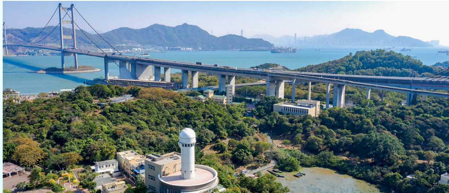
Nature Garden preserves thousands of native trees, providing a natural habitat for wild animals and insects 大自然公園保留了數千棵原生樹木，為野生動物及昆蟲提供棲身之所