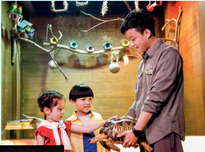
The Ark Expo has conserved numerous protected endangered species, including the radiated tortoise and African grey parrot 「方舟博覽館」養飼了多款受保護的瀕危動物，如屬輻射龜及非洲灰鸚鵡等

The Group attaches great importance to Environmental, Social and Governance (ESG), and contributes to the sustainable development of society. One of the Group's key ESG initiatives is developing and managing Ma Wan Park, on Man Wan, an island in Hong Kong. The Group has preserved the native ecosystem in Ma Wan, while spreading the green message, and to fulfil its mission of educating the public and caring for the underprivileged. Ma Wan Park not only serves as a tourist spot for edutainment, but also as a platform to serve the community.