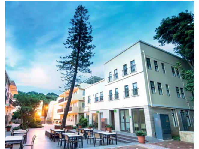
Located next to Nature Garden and Solar Tower, the Solar Villas (formerly known as the Solar Tower Camp) were converted from old Ma Wan village houses from the early days. Opened in 2012, Solar Villas offers 44 guestrooms and provide visitors with a green and tranquil vacation experience 毗鄰大自然公園及太陽館的太陽村莊（前稱太陽館度假營），由馬灣早期的舊村屋修復而成，於2012年啟用，設有44間客房，為旅客帶來綠意清幽的度假體驗

由建於50年代的芳園書室（小芳園）活化而成的「古蹟館」，展出於1997年在馬灣出土的文物，包括清代磚窯