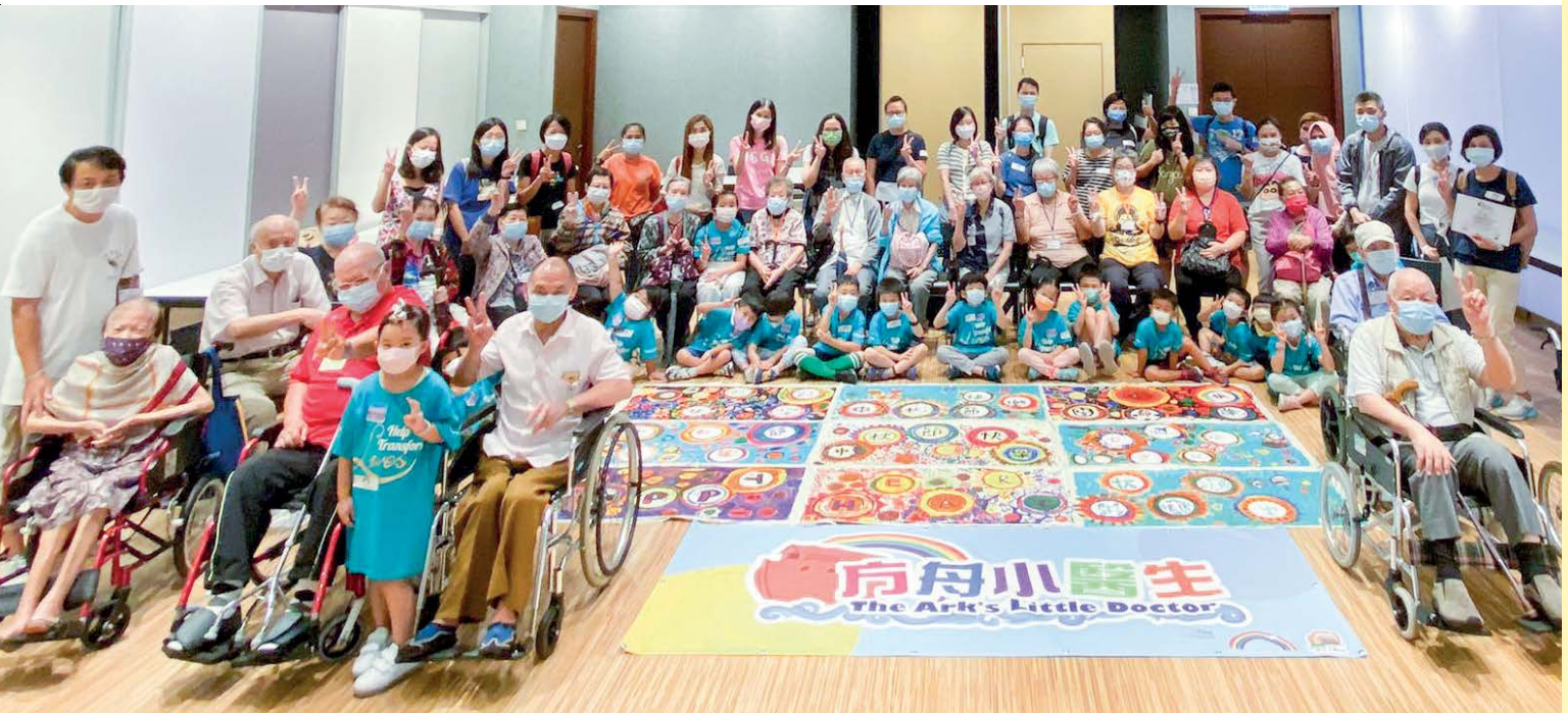
Over the past 10 years, Ma Wan Park has organized over 10,000 diverse activities for the underprivileged, children and youngsters, with over 700,000 beneficiaries 馬灣公園在過去十多年來，為基層、兒童和青少年舉辦逾萬個多元化活動，受惠人數超過700,000