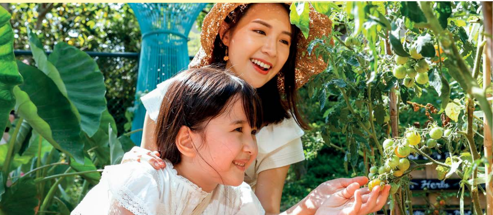
Ma Wan Park promotes the importance of environmental conservation to the younger generation through various activities 馬灣公園透過不同活動，向年輕一代推廣環境保育的重要性