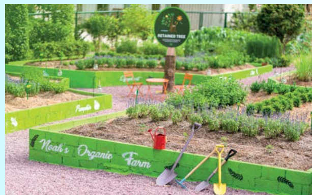
The newly launched Noah's Organic Farm offers visitation, educational and charity programs for groups, by appointment 新啟用的「挪亞有機農莊」開放予團體預約參觀、教學及公益等企劃活動

In addition, to promote the value of sustainable development for the next generation, the Ma Wan Park team launches the community planting scheme and organizes workshops to teach the public how the waste collected from Nature Garden is recycled into wood chips. The workshop will also show how to produce other useful material by mixing special food waste from the harvest restaurant with the recycled wood chips.