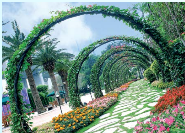
Sweet Garden 意中國