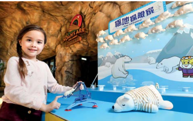
Noah's Ark often organizes seasonal thematic events, providing edutainment for visitors 挪亞方舟不時舉辦特色主題活動，讓訪客寓學習於娛樂