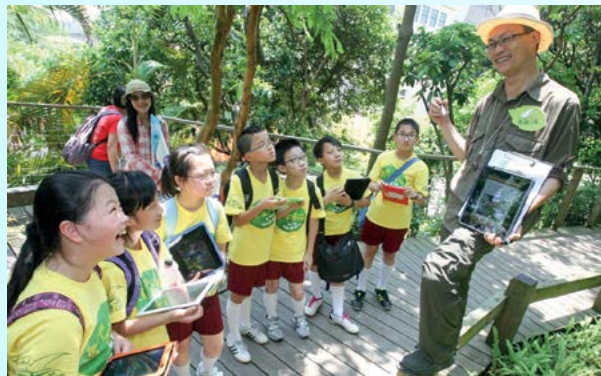
The Group built an elevated wooden walkway across Nature Garden to allow visitors to walk through the garden without disturbing the nature 集團築起架空木棧道貫通大自然公園，讓遊客可以在不影響大自然的情況下在園內遊覽

集團重視環保、社會及管治 (ESG)，為社會可持續發展作出貢獻，例如通過發展及營運位於香港島嶼馬灣的馬灣公園，以保育馬灣原有生態，宣揚環保信息，以及實踐教育大眾及關愛基層社群的使命。馬灣公園不僅是香港一個寓教育於玩樂 (Edutainment) 的旅遊景點，亦成為一個回饋社會的平台。