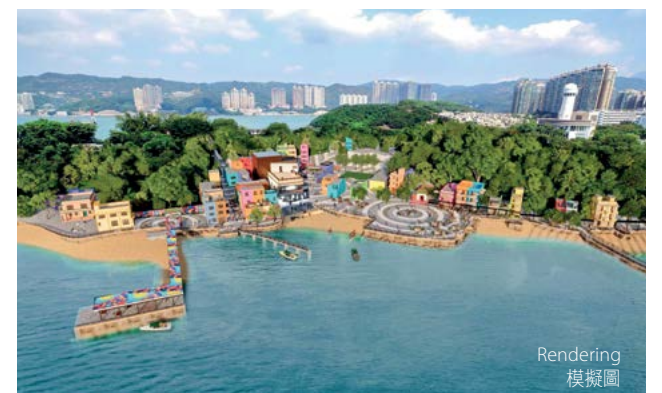
The Ma Wan Park Phase 2 project focuses on the preservation, restoration and revitalization of the old buildings in Ma Wan village into an arts village 馬灣公園第二期發展項目，主要是為馬灣舊村的建築進行保育、復修及活化工程，並活化為藝術村