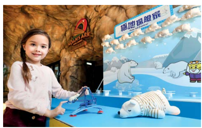
Noah's Ark often organizes seasonal thematic events, providing edutainment for visitors 挪亚方舟不时举办特色主题活动,让访客寓学习于娱乐