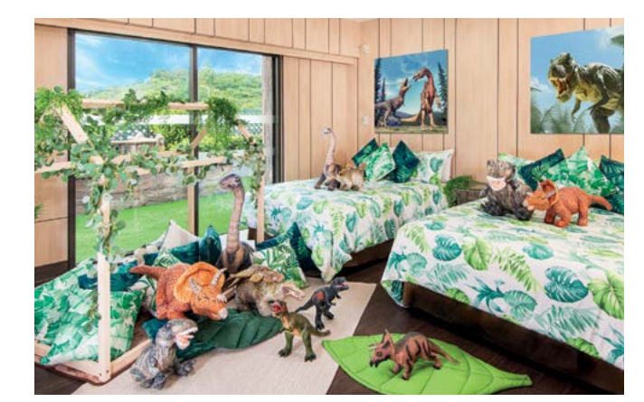
Noah's Ark Hotel & Resort features multiple themed rooms with fun designs to provide customers with a spectacular experience 挪亚方舟度假酒店设有不少奇趣设计的主题客房,让住客倍添惊喜

计的主题客房,为游客带来极具特色的度假体验。 此外,挪亚方舟内更设有大型宴会厅、婚礼场地及餐厅,适合 举办聚会、大型活动、会议和婚礼等,满足不同人士需要。