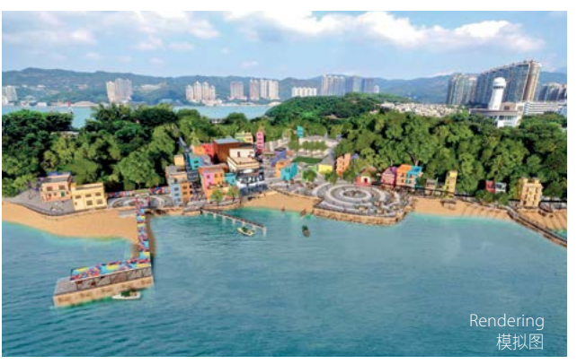
The Ma Wan Park Phase 2 project focuses on the preservation, restoration and revitalization of the old buildings in Ma Wan village into an arts village 马湾公园第二期发展项目,主要是为马湾旧村的建筑进行保育、复修及活化工 程,并活化为艺术村