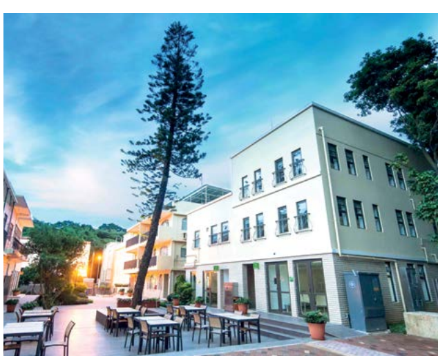
Located next to Nature Garden and Solar Tower, the Solar Villas (formerly known as the Solar Tower Camp) were converted from old Ma Wan village houses from the early days. Opened in 2012, Solar Villas offers 44 questrooms and provide visitors with a green and tranquil vacation experience 毗邻大自然公园及太阳馆的太阳村庄(前称太阳馆度假营),由马湾早期的旧村 屋复修而成,于2012年启用,设有44间客房,为旅客带来绿意清幽的度假体验

由建于50年代的芳园书室(小芳园)活化而成的"古迹馆",展出于1997年在马 湾出土的文物,包括清代砖窑