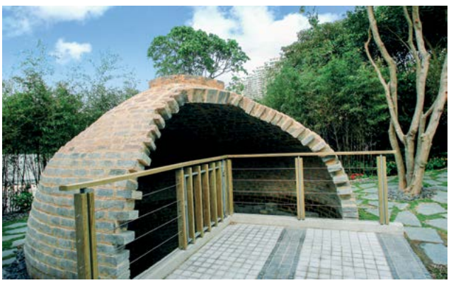
The Heritage Centre was revitalized and converted from the Fong Yuen Study Hall (Junior Fong Yuen), which was built in the 1950s. It displays some of the historical relics uncovered on Ma Wan in 1997, including a Qing Dynasty brick

此外,马湾公园团队亦启动了社区种植计划和筹办 工作坊,教导公众利用大自然公园内收集的园林废 物,制作成环保木碎,再混合丰盛阁餐厅的特选厨 余,循环再造出其他有用物料,务求向下一代宣扬 可持续发展理念的重要性。