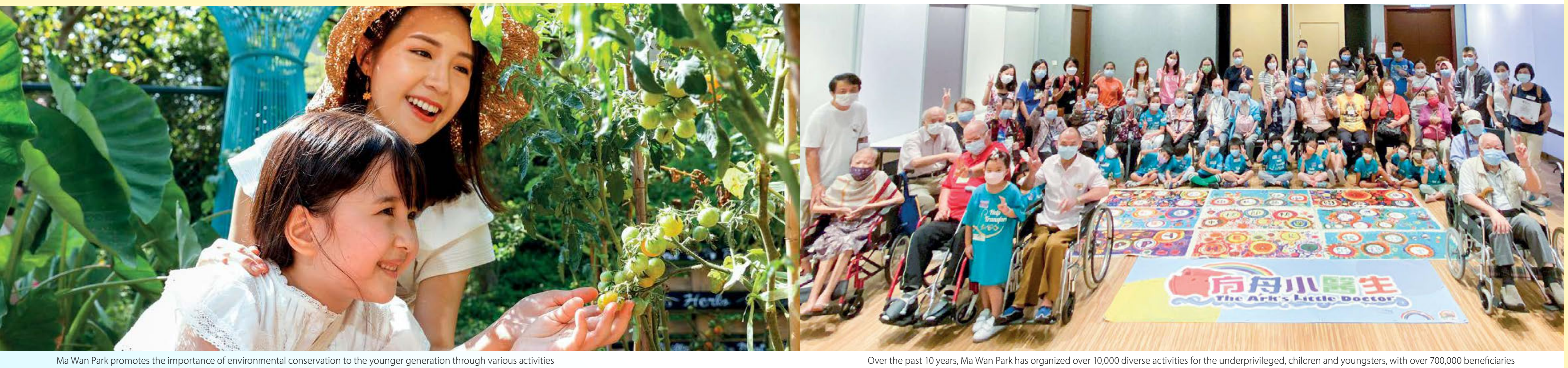
Ma Wan Park promotes the importance of environmental conservation to the younger generation through various activities 马湾公园通过不同活动,向年轻一代推广环境保育的重要性