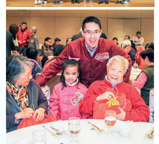
Ma Wan Park collaborates with local charity groups to organize different community activities, in which Group top management actively

马湾公园在过去十多年来,为基层、儿童和青少年举办逾万场多元化活动,受惠人数超过700,000