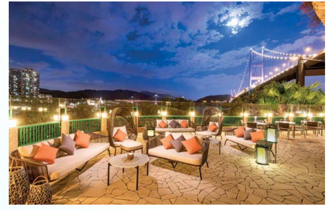
Adjoining the beautiful beach is the alfresco seaside restaurant Harvest Beachside, which is filled with holiday vibes and the perfect location for dining, a wedding or a private party

位于优美沙滩旁的户外滨海餐厅Harvest Beachside,洋溢一片度假氛围,提供餐 饮、婚礼及专属派对服务