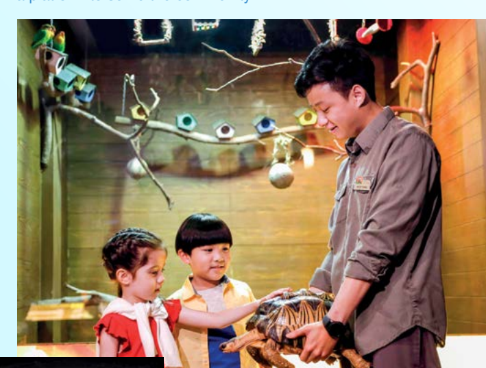
The Ark Expo has conserved numerous protected endangered species, including the radiated tortoise and

The Group attaches great importance to Environmental, Social and Governance (ESG), and contributes to the sustainable development of society. One of the Group's key ESG initiatives is developing and managing Ma Wan Park, on Man Wan, an island in Hong Kong. The Group has preserved the native ecosystem in Ma Wan, while spreading the green message, and to fulfil its mission of educating the public and caring for the underprivileged. Ma Wan Park not only serves as a tourist spot for edutainment, but also as