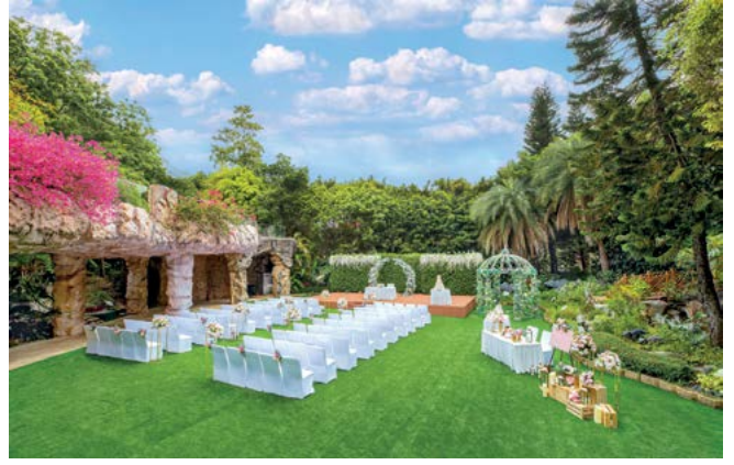
Noah's Ark Hotel & Resort has grand ballrooms and wedding venues for organizing different types of banquets, weddings and parties 挪亚方舟度假酒店设有大型宴会厅及婚礼场地,适合举办不同种类的宴会、婚

位于优美沙滩旁的户外滨海餐厅Harvest Beachside,洋溢一片度假氛围,提供餐 饮、婚礼及专属派对服务