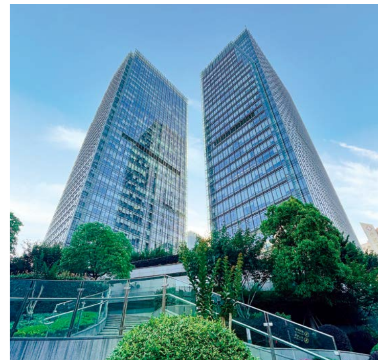
In the reporting year, Shanghai IFC (right) and Shanghai ICC (left) attained the Platinum rating in the LEED V4.0 for Building Operations and Maintenance: Existing Buildings in 2020/21. 在報告年度，上海國金中心（右）和上海環貿廣場（左）榮獲LEED「既有建築：營運與保養4.0版」鉑金級認證

Sustainable buildings: The Group aims to get LEED certification for all new investment properties.