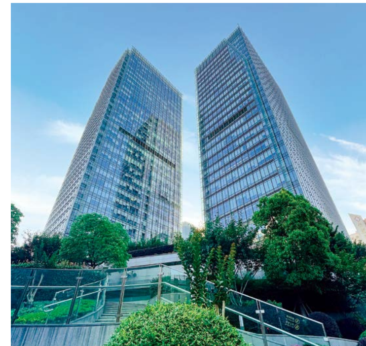
In the reporting year, Shanghai IFC (right) and Shanghai ICC (left) attained the Platinum rating in the LEED V4.0 for Building Operations and Maintenance: Existing Buildings in the reporting year. 上海国金中心(右)和上海环贸广场(左)荣获LEED“既有建筑:运营与保养4.0版”铂金级认证

Sustainable buildings: The Group aims to get LEED certification for all new investment properties.