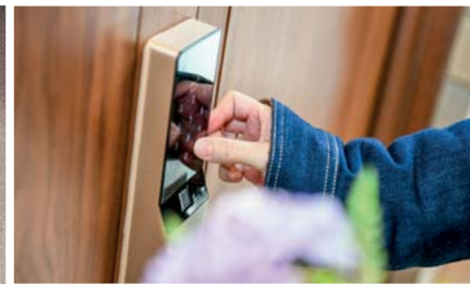
All units in Shanghai Arch Phase 2 have a balcony facing the river and a smart home system 濱江凱旋門二期戶戶設有朝江陽台，兼備智能家居系統