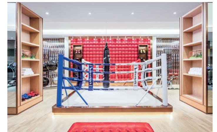
Residents can enjoy sweating in the kick-boxing room 住客可在拳擊健身房盡情揮灑汗水

住宅單位配套細心體貼，當中包括多個升級配置，為住客帶來更優質的品味生活。主人房配置步入式衣櫃，充分體現豪宅氣派。冷氣機具備PM2.5（微細懸浮粒子）過濾功能，有效保障室內空氣質素。全屋設有軟水系統，貼心照顧住客健康。地暖採用水暖系統，更添舒適。