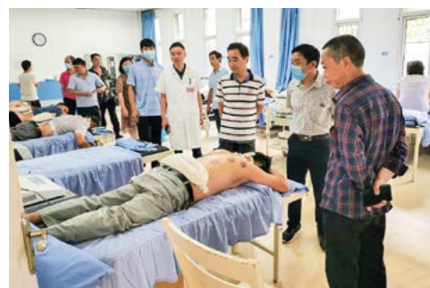
The SHKP-Kwoks' Foundation sponsors the Rural Doctors Training Programme in Nanjiang county, in Bazhong city, Sichuan, supporting healthcare services as part of its poverty relief initiatives for the country 新地郭氏基金資助四川省巴中市南江縣鄉村醫生培訓項目，為國家的健康扶貧出一分力

項目由南江縣衛健局承辦，於2018至2020年期間舉辦五期培訓班，為全縣約500名鄉村醫生提供理論與實踐兼備的培訓，以提高診症水平。培訓項目近日圓滿結束，經考核合格的醫生亦已正式投入鄉村衛生醫療服務，為村民帶來更快捷、及時的診斷與治療。