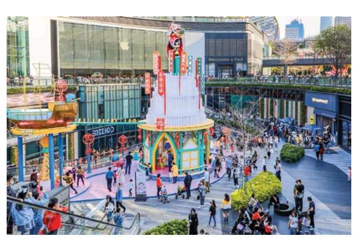
In Parc Central, Guangzhou, a Chinese New Year doll, dressed in an auspicious southern lion costume, dances on the top of the lucky tower in The Garden, bringing good luck to customers

上海One ITC運用粉色LED網燈,在Co-Fun戶外區構建成色彩繽紛的蝴蝶球 燈,營造出趣味與藝術融合的奇幻樂園