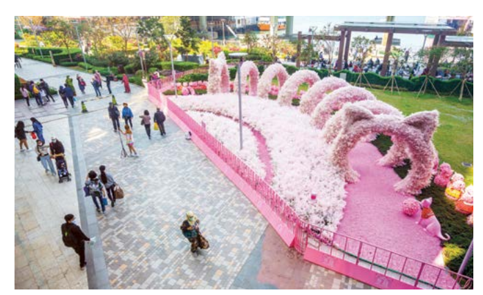
During Chinese New Year, Harbour North turns its outdoor floral tunnel into a cat shape to match its CAT ART gallery to an encouraging response 新春期間,北角匯配合「貓、美術館」主題,將戶外花花隧道塑造成貓咪形,深受遊

YOHO MALL「白鷺花園」 換上新裝,以五彩夢幻花海配襯大型白鷺雕塑裝置,為毗 鄰戶外餐飲區帶來全新景致