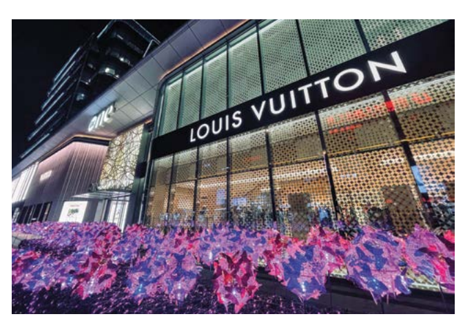
One ITC in Shanghai uses pastel-coloured LED net lights to create colourful butterfly-ball lights in the Co-Fun outdoor zone, presenting a fantasy land with both fun and art installations

上海One ITC運用粉色LED網燈,在Co-Fun戶外區構建成色彩繽紛的蝴蝶球 燈,營造出趣味與藝術融合的奇幻樂園