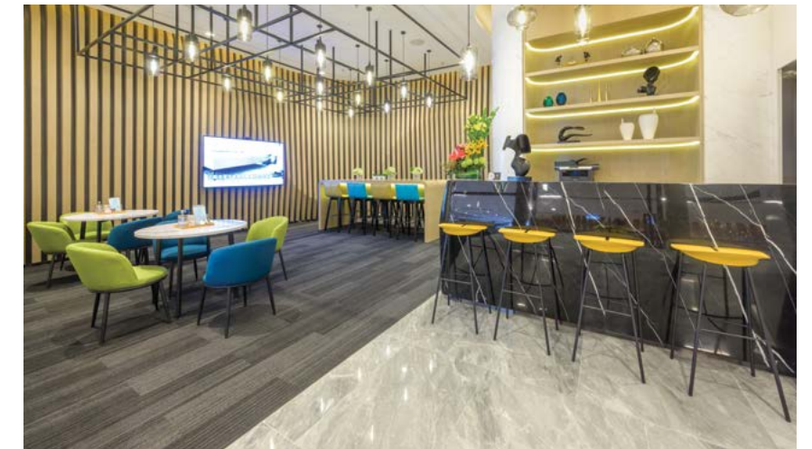
The indoor co-sharing space, Club W, can accommodate a variety of corporate events, such as video conferences, product launches and even private parties 室內共享空間「Club W」適合舉辦各類企業活動，如視像會議、產品發布會甚至私人派對等

作為W系列發展項目的最新作品，W LUXE將「WORK+」概念加強，引入工作與生活平衡的辦公新體驗，帶來兩個各具特色的共享空間，並由專業管理團隊提供增值服務，體貼中小企及初創企業的業務需要。位於1樓的「Club W」可用作舉辦各類企業活動，而設於2樓平台的戶外綠化空間「The O 2 」則適合舉辦各種交流活動，舒展身心。