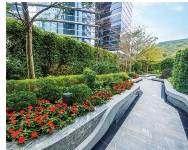
The O 2 green area, on Level 2, provides a pleasant outdoor atmosphere 2樓特設戶外綠化空間「The O 2 」，環境怡人

於W LUXE步行約四分鐘，即可直達港鐵石門站，連繫鐵路網絡。待屯馬綫於今年全綫通車後，往返新界西更見便捷。此外，項目同時坐擁主要道路網絡，連接四大主要隧道（大老山隧道、獅子山隧道、尖山隧道及城門隧道），輕鬆迅達全港各區。