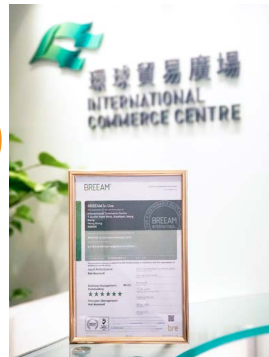
ICC receives the top 'Outstanding' rating in the BREEAM In-Use scheme under the BREEAM, developed by the BRE. 环球贸易广场在英国建筑研究院的绿色建筑评估系统BREEAM In-Use中得到最高级别“杰出”评级

In the BREEAM In-Use scheme, under the Building Research Establishment Environmental Assessment Method (BREEAM), developed by the Building Research Establishment (BRE) in the UK, ICC got full marks in three assessment categories and received the 'Outstanding' rating which is the top rating in the scheme. The BREEAM certification, which is the first of its kind in Hong Kong, is recognition of ICC's excellent management. It placed the skyscraper in the top 3% of green buildings around the world, setting an exceptional sustainability standard in Hong Kong.