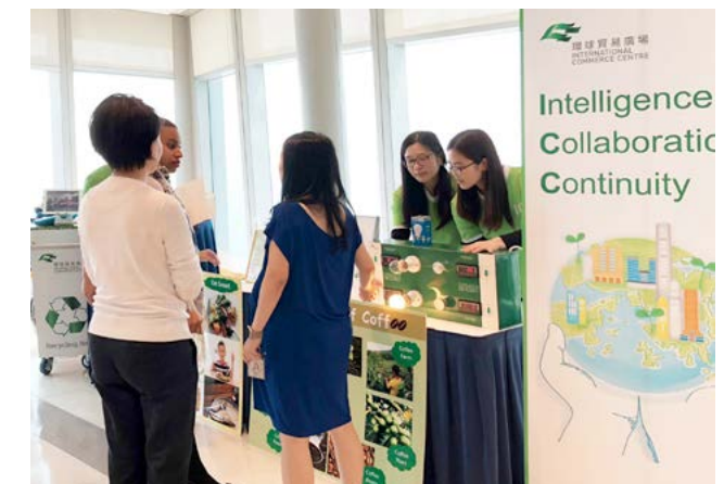
ICC engages tenants and stakeholders in green and energy-saving initiatives. 环球贸易广场与租户及股东携手进行环保及节能工作。

环球贸易广场对可持续发展的重视深受业界认同。早在2017年，环球贸易广场获香港绿色建筑议会颁发第一张“绿建环评既有建筑2.0版”最高级别的铂金级认证证书。在2019年，则获香港质量保证局颁发第一个ISO 41001:2018设施管理体系。在环境局及机电工程署举办的“慳神有计大比拼”中，连续三年获得“慳神奖”，在2017年更勇夺“慳神总冠军”。