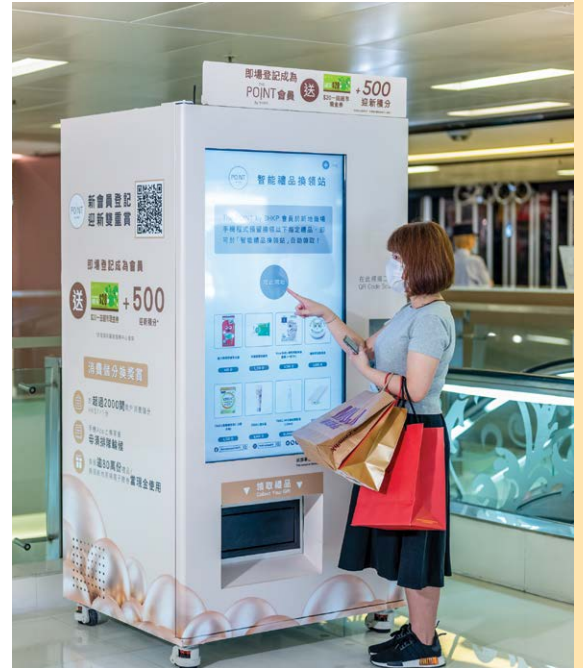
The Point by SHKP members can redeem gifts with their bonus points at the Smart Gift Redemption Stations on their own to avoid queuing up The Point by SHKP会员凭积分可在智能礼品换领站自助换领礼品，避免排队等候

The Point by SHKP商场综合会员计划（“The Point by SHKP”）继去年推出全港首个免触式泊车服务后，今年再创新猷，推出“无感泊车支付”升级功能，进一步提升客户体验。另外，为方便换领礼品，在疫情爆发后，新地商场设置了智能礼品换领站，让The Point by SHKP会员凭积分可自助换领礼品。