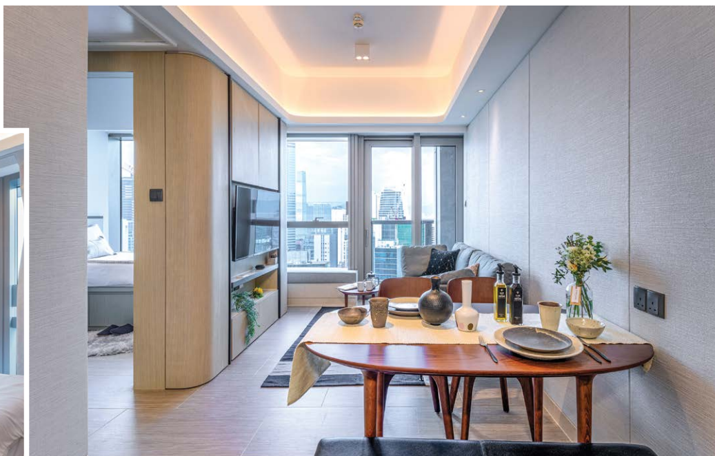
TOWNPLACE SOHO provides inviting designs and flexible leasing options to fit the lifestyle and preferences of millennials TOWNPLACE SOHO提供别致设计及多元化租赁模式，迎合新世代的生活模式及喜好

集团日前推出全新住宅租赁品牌——“TOWNPLACE本舍”。品牌通过选址、别致设计、多元化租赁模式、具备完善设施的共享空间以及崭新智能家居科技等，全方位迎合新世代对自主生活模式的追求，让他们构建出高度个人化的家居及社区。项目包括之前推出并备受市场欢迎，位于坚尼地城的TOWNPLACE KENNEDY TOWN（前称隽庭），以及最新位于中环坚道的TOWNPLACE SOHO。