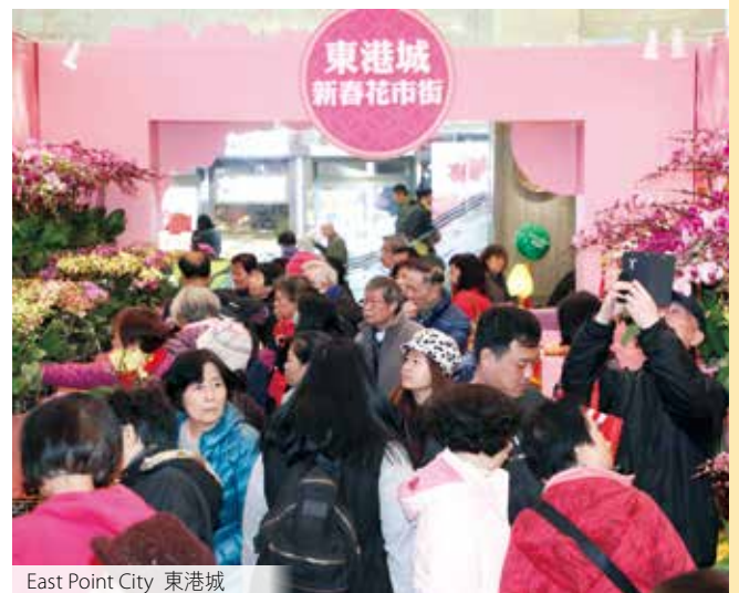
East Point City 東港城