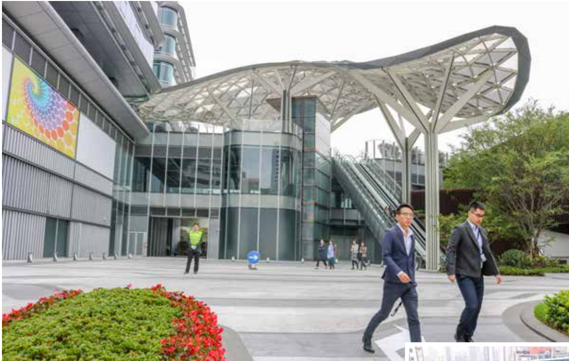
One ITC is now the address for various multinationals 多間跨國企業選址於國貿匯

集團一直以來以選擇性投資策略發展內地業務，專注在一線城市的黃金地段發展，其在上海重點發展的大型綜合項目徐家匯國貿中心憑藉優質的設計、有利的地理位置和完善交通網絡一直備受注目。項目分期發展，工程進展順利，第一期國貿匯寫字樓部分自開展租務以來，市場反應令人鼓舞。