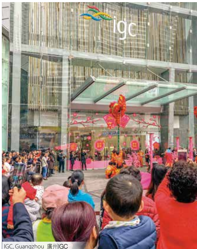
IGC, Guangzhou 廣州IGC

新城市廣場與LEGO合作打造全球首個農曆新年大宅院主題佈置，當中最矚目的是由150,000顆LEGO bricks全人手砌成的巨型鴻運醒獅。V City請來飛天小女警現身不同位置，發放正能量。天環有《捉妖記2》的胡巴在風車林、荷花池及連心橋等場景迎接顧客，喜氣洋洋。