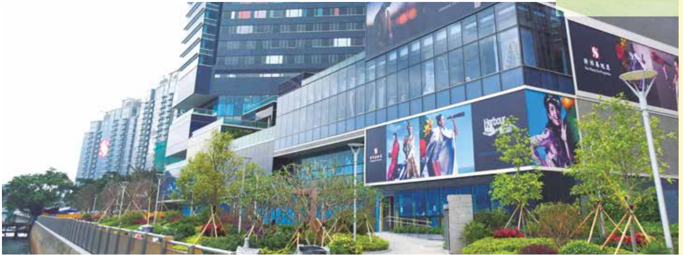
Harbour North is set to become a leisurely shopping hot spot along the harbourfront 北角匯勢將成為舒適寫意的海濱購物消閒新據點