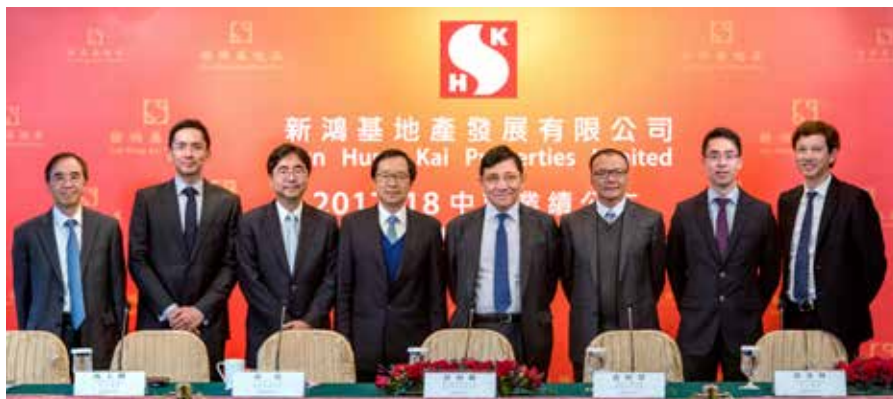
Group Chairman & Managing Director Raymond Kwok (fourth right) announcing 2017/18 interim results with top management

The Group's rental income is expected to show steady and satisfactory growth, driven by the expansion of its investment property portfolio, high occupancies and positive rental reversions. V Walk in West Kowloon, Hong Kong and the mall