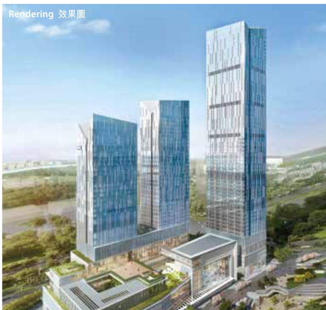
Nanjing IFC 南京國金中心