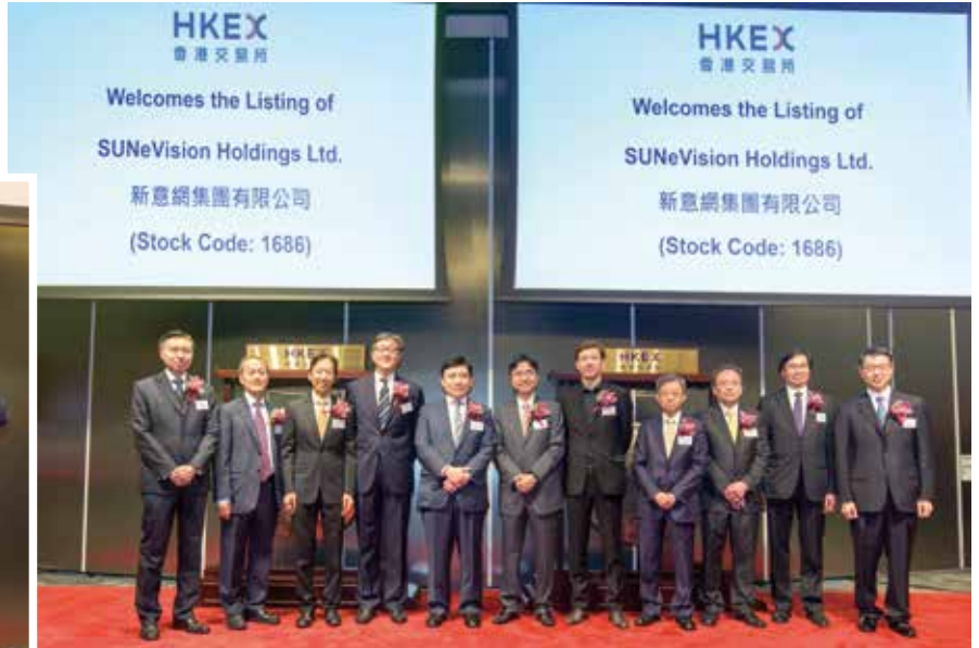
Group Chairman & Managing Director and SUNeVision Chairman Raymond Kwok (fifth left) with SUNeVision's board of directors at the ceremony 集團主席兼董事總經理以及新意網主席郭炳聯(左五)與新意網董事合照留念

新意網集團有限公司及股份自2000年3月17日起於創業板上市及買賣，為早期於創業板上市的其中一家公司。經過多年來的業務發展，新意網已成為本港數據中心的主要營運商，並受惠經常性收益流，就股東應佔溢利而言，於多年來已達於主板上市的要求。