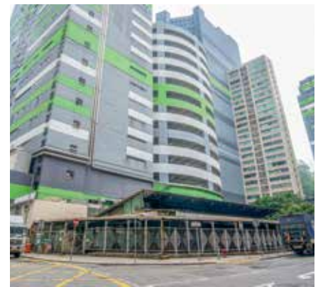
SUNeVision's new site at Ma Kok Street, Tsuen Wan 新意網於荃灣馬角街新近投得的地皮

新意網於一月，透過政府招標，投得位於荃灣馬角街的荃灣市地段第428號用地，項目總樓面面積可達201,700平方呎。新意網於區內過往提供較少的數據中心容量，地皮將用作增強數據中心組合，確保公司具有良好的容量，以有效地服務各客戶，長遠可提高收入基礎。