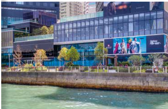
Harbour North 北角匯