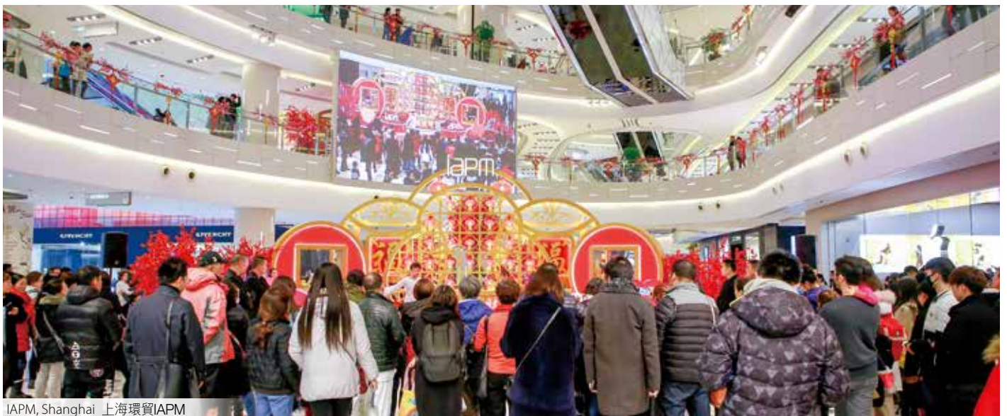
IAPM, Shanghai 上海環貿IAPM