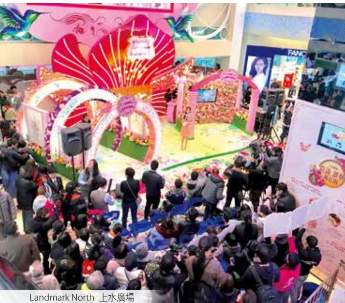
Landmark North 上水廣場