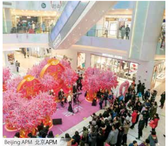
Beijing APM 北京APM