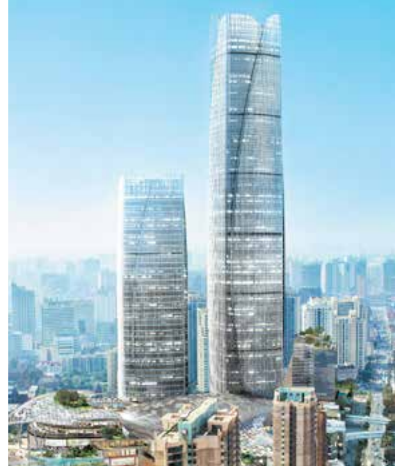
Shanghai ITC 上海徐家匯國貿中心