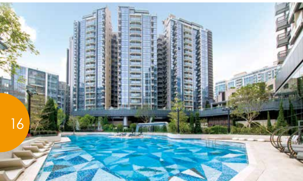
An approximately 40-metre long outdoor swimming pool which is set against the backdrop of a cascading waterfall to create a truly relaxing vibe 6 約40米長室外泳池飾以瀑布水景點綴，使人身心舒泰 6

Ocean Wings, the Group's latest waterfront residential and commercial development in Tseung Kwan O South, has been completed and new owners are in the process of taking possession of their units. As the final project under The Wings series 1 , Ocean Wings conveys an aura of stylish and chic elegance with upgraded materials and clubhouse facilities. Residents can also take full advantage of the fast growing neighbourhood nearby that has been carefully planned to meet everyone's needs.