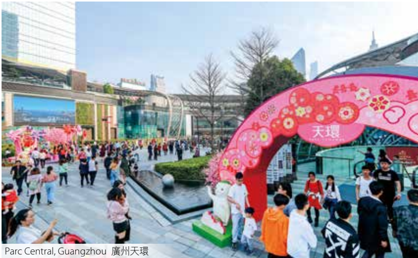
Parc Central, Guangzhou 廣州天環

國際金融中心商場設置內有108條數碼錦鯉的祝願池。顧客透過流動裝置可拋下虛擬金幣許願，接收新年祝賀語句。東港城連續第12年舉辦全港最大室內年宵市場暨新春花展會，今年更引入QR Code蘭花圖鑑，方便選購。上水廣場的Pop-Up藝術展，展出五米高巨型蓮花及多種花卉植物；並設有VR四感體驗之旅，讓顧客親歷3D花花世界。YOHO MALL舉辦大型室內年宵，在和風春日祭的氣氛下，帶來環球特色及地道美食。北京APM在桃花林中，放上巨型銅錢及彩色燈籠，祝願顧客時到運到。IGC中庭懸掛近二米直徑的大型花球，喜迎新春，祝願顧客新一年鴻運當頭。