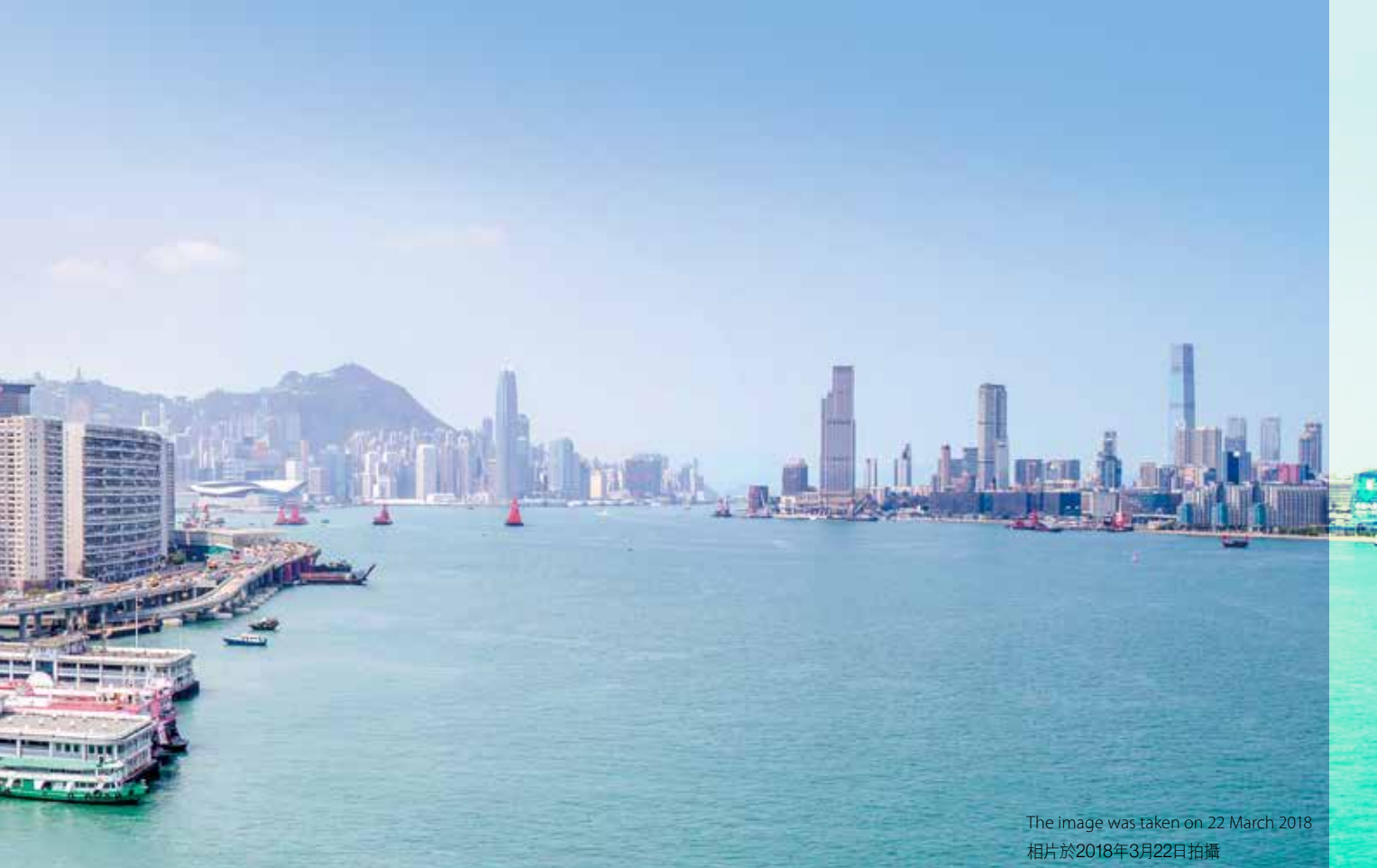
The image was taken on 22 March 2018 相片於2018年3月22日拍攝

The image was not taken at the Development and does not illustrate the final appearance of the Development upon completion. It has been processed with computerized imaging techniques. The image shows the general environment, buildings and facilities surrounding the Development. The image is for reference only. The environment, buildings and facilities surrounding the Development may change from time to time.