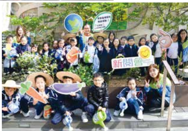
Students visiting the green education centre at an SHKP mall in a Learn Beyond Books activity 同學參加「走出書本」活動，到新地商場的環保教育中心參觀