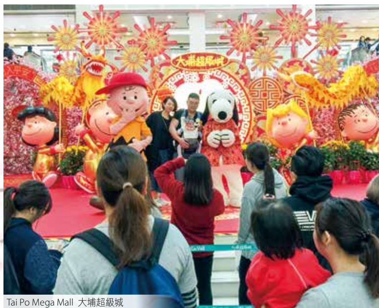
Tai Po Mega Mall 大埔超級城