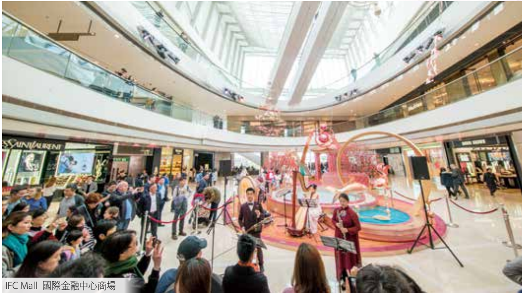
IFC Mall 國際金融中心商場