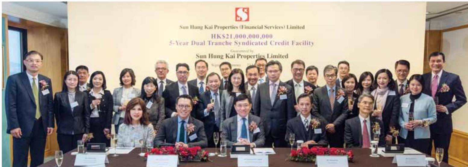
Group Chairman & Managing Director Raymond Kwok (front, centre) with bank representatives at the syndicated credit facility signing ceremony 集團主席兼董事總經理郭炳聯(前排中)在銀團貸款簽署儀式上與銀行代表合照