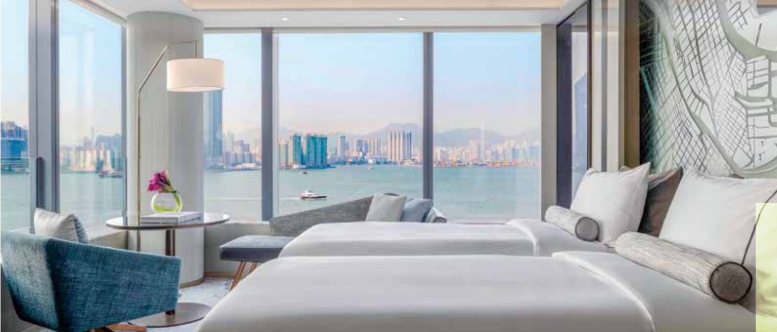
All guest rooms and suites at Hotel VIC boast breathtaking Victoria Harbour views 海匯酒店全部客房及套房可享維港迷人景致

位於北角海旁的酒店名為海匯酒店，將以親民價格提供豪華住宿服務，吸引一眾年輕及精明的旅客和商務客人。酒店將於今年中正式開幕。