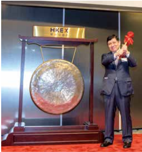
Group Chairman & Managing Director and SUNeVision Chairman Raymond Kwok strikes the gong to officiate the transfer of SUNeVision's listing to the Main Board 集團主席兼董事總經理以及新意網主席郭炳聯主持新意網在 主板的掛牌儀式