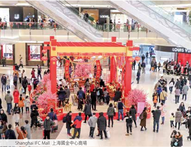
Shanghai IFC Mall 上海國金中心商場