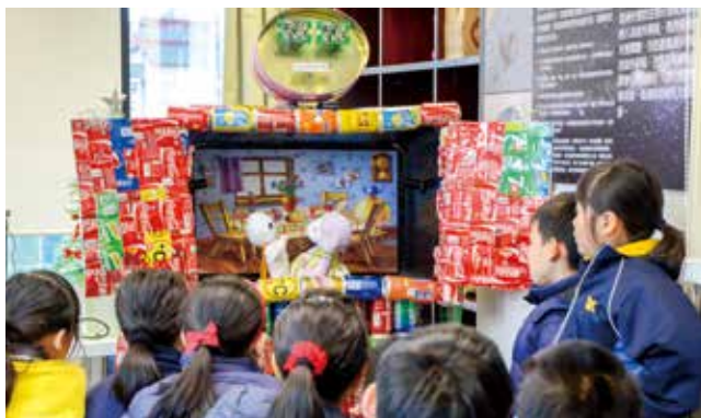
Students learning about the upcycling concept at the puppet show 同學觀賞木偶劇表演，認識廢物重生概念

項目早前安排了兩間小學參觀上水廣場的環境復育園和氣候變化及互動創新中心。在上水廣場環保大使介紹下，同學認識更多有關氣候變化的成因及影響，並紛紛表示今後會多吃菜及多步行來減少二氧化碳的排放；他們又從木偶劇表演中，了解廚餘回收及變成有機肥料的過程。