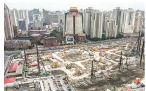
The construction site of ITC Phase 4 is progressing on schedule 徐家匯國貿中心四期地盤，工程進度理想