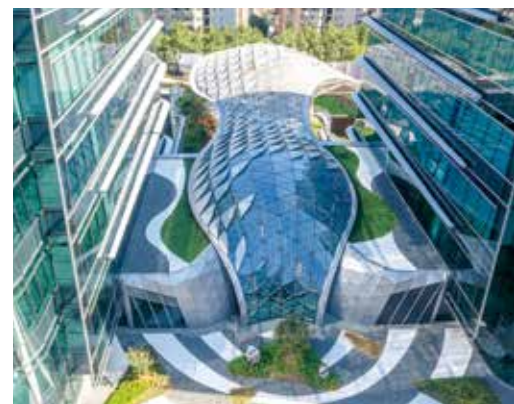
One ITC includes two office towers and a shopping mall 國貿匯由兩幢寫字樓和一個商場組成

Due for completion in the second half of this year, phase 2 of ITC will provide about 320,000 square feet of offices and about 43,000 square feet of retail space. Pre-leasing is underway with positive market responses. Construction of the remaining phases, which will feature office towers, shopping malls and a five-star hotel, is progressing on schedule. The entire project is expected to be completed in 2023, which will bring a fresh impetus to the economy of Xujiahui and further strengthen the district's position as a prominent central business district in Shanghai.