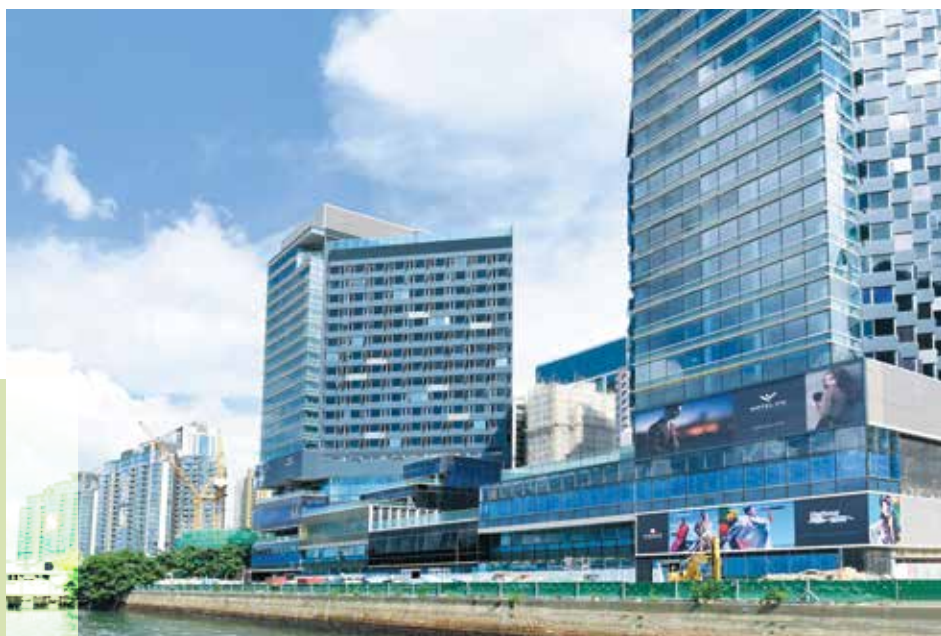
Hotel VIC opening in the middle of the year 海匯酒店將於今年中正式投入服務

海匯酒店的平台部分將連接北角匯，方便客人前往商場購物、消閒及享受環球美食。另外，酒店對出連繫北角匯以至海濱發展項目的海濱長廊長約420米，適合客人及遊人欣賞維港景致，享受悠閒生活風格。海濱長廊將隨著酒店在今年中投入服務後，開放予公眾人士使用。