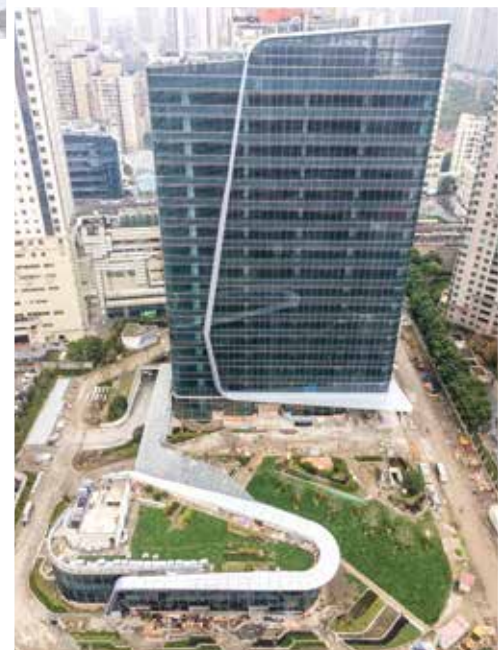
Phase 2 of ITC will complete by this second half 徐家匯國貿中心二期快將於今年下半年落成

徐家匯國貿中心二期預計今年下半年落成，將提供約320,000平方呎的寫字樓及約43,000平方呎的零售樓面，目前正進行預租，市場反應理想。項目餘下期數包括寫字樓、商場及一間五星級酒店，建築工程如期進行。整個項目預計於2023年落成，將可為徐家匯經濟發展提供新動力，進一步加強該區作為上海市主要中央商業區的地位。