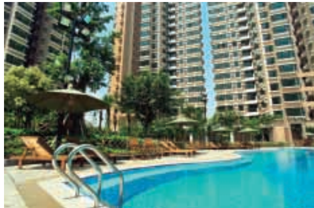
BeneVille is the Group's latest low-density residential development in Tuen Mun.

The Group expects to complete 3.1 million square feet of residential properties in 2004/05 and 3.6 million square feet in 2005/06. Higher margins resulting from the Group's recognized brand name and favourable market conditions are likely to enhance profitability.