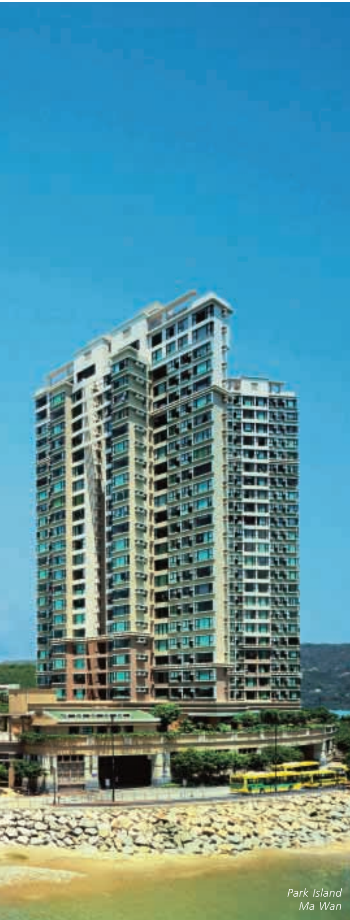
Park Island Ma Wan