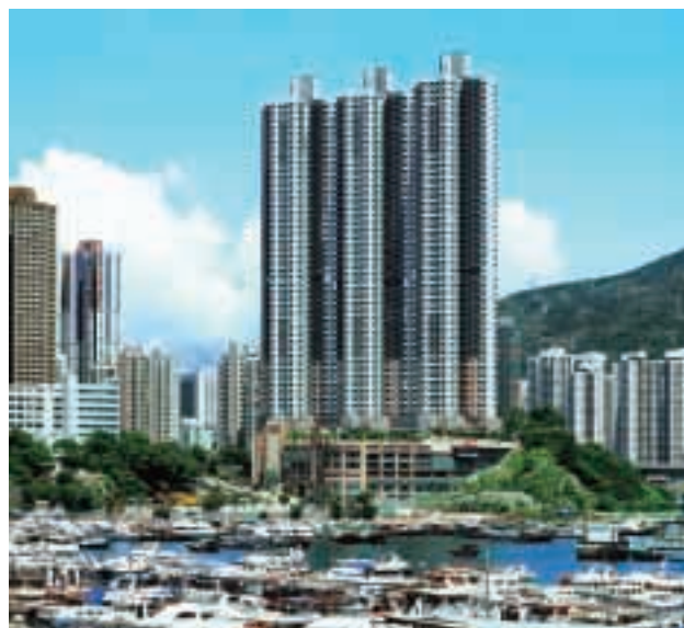
Sham Wan Towers is conveniently located in Island South overlooking the marina.