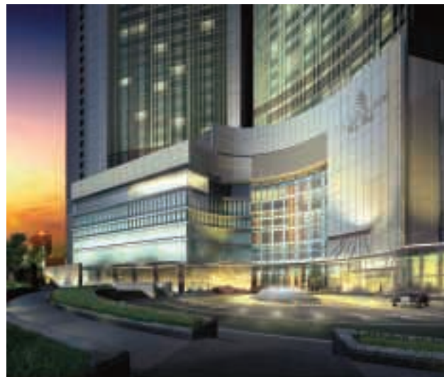
Four Seasons Hotel and Four Seasons Place at Hong Kong Station will set new standards of excellence.

This six-star hotel complex is the last leg of the massive development above Hong Kong Station, made up of the first Four Seasons Hotel in Hong Kong and the Four Seasons Place serviced suites. Completion is expected by early next year and the hotel complex should open for business in mid 2005.