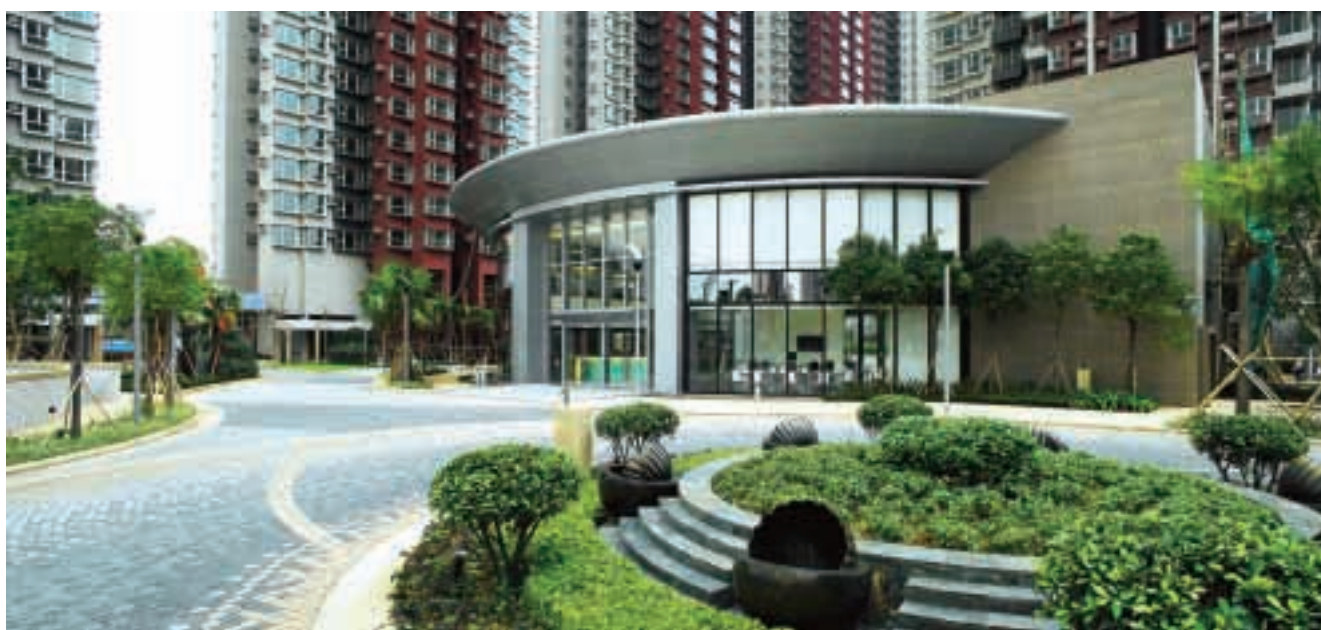
YOHO Town is the latest development in the western New Territories with full clubhouse facilities and a lush landscaped environment.

Most of the Group's 22.3 million square-foot development land bank is earmarked as residential properties for sale. The majority of these will be large-scale estates with mainly small and medium units, but the Group will also develop more large luxury units in selected future developments.