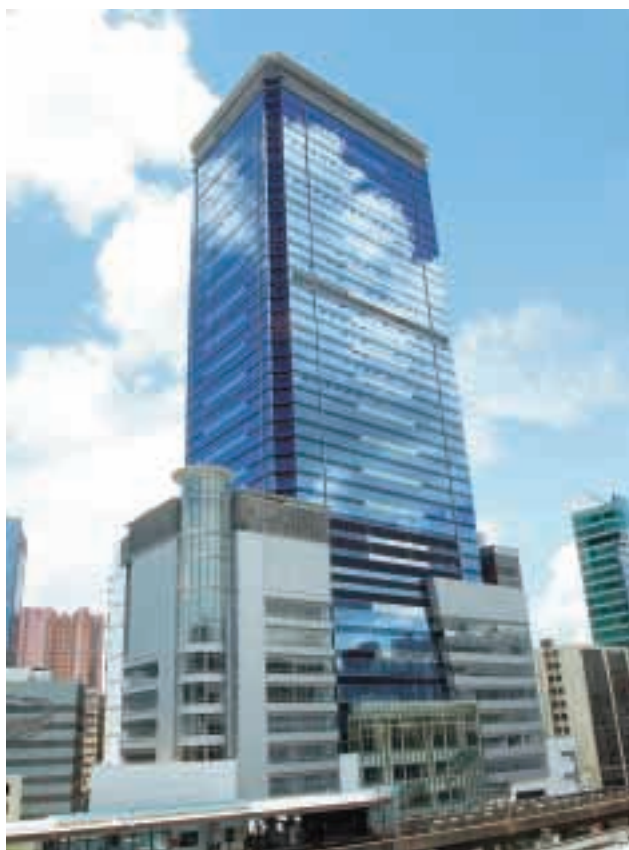
The 600,000 square-foot APM shopping mall at Millennium City Phase 5 will redefine shopping in Kowloon East.

Millennium City Phase 5 contains the 600,000 square-foot APM shopping mall, one of the largest in Kowloon East, and about 700,000 square feet of grade-A office space. The offices were originally intended as a long-term investment, but the Group sold 407,000 square feet to a local bank for its own use and will retain the remainder for rent. Pre-leasing is progressing well. Opening of the mall is planned for early 2005 and it is already over 85 per cent let.