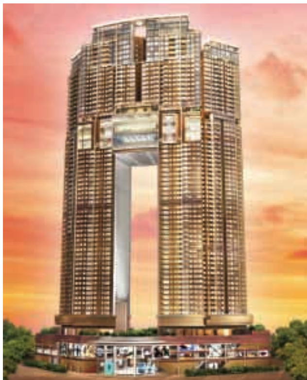
The Victory Arch at Kowloon Station will have the territory's first Sky Club and set new standards of luxury.