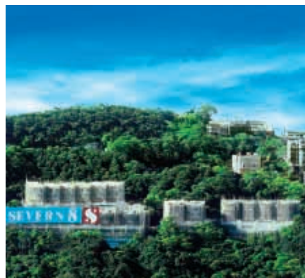
Severn 8 on the Peak: the address speaks for itself.