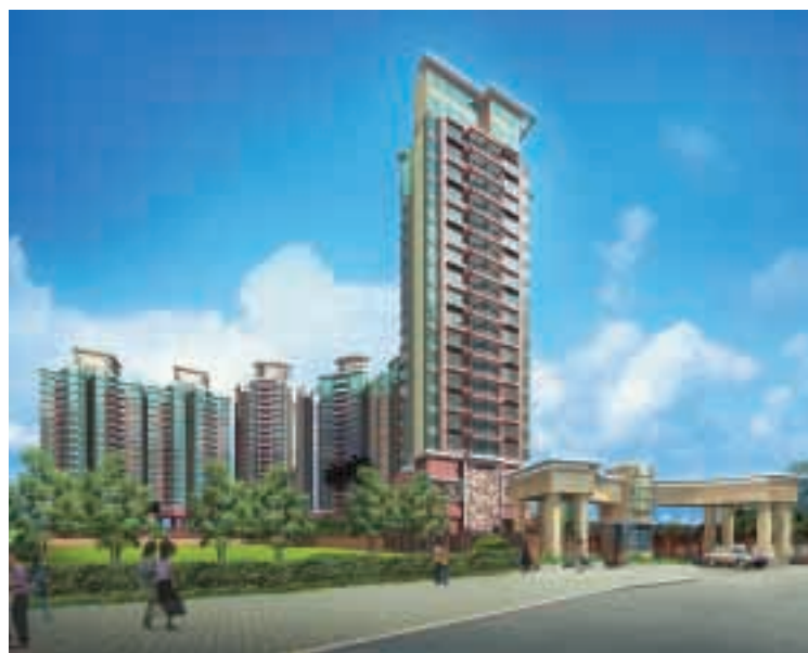
The Tin Ping Shan development in Sheung Shui will be the finest residence in the district with unrivalled transport convenience.