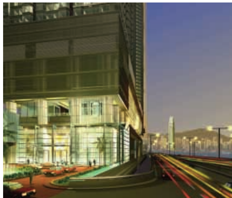
Airport Railway Kowloon Station Development Packages 5, 6 & 7 will offer 5.4 million square feet of top-quality offices, residential units, serviced apartments, hotel and retail spaces.

The development will have 2.5 million square feet of top-quality offices, one million square feet of residential units and serviced apartments, another million square feet of hotel space and 0.9 million square feet of retail space. It will include the tallest building in Hong Kong, with ultra-modern facilities to meet the needs of modern business tenants. Work has started on the first phase of over 700,000 square feet of residential units and serviced apartments. W Hotels will manage one of the hotels in the development.