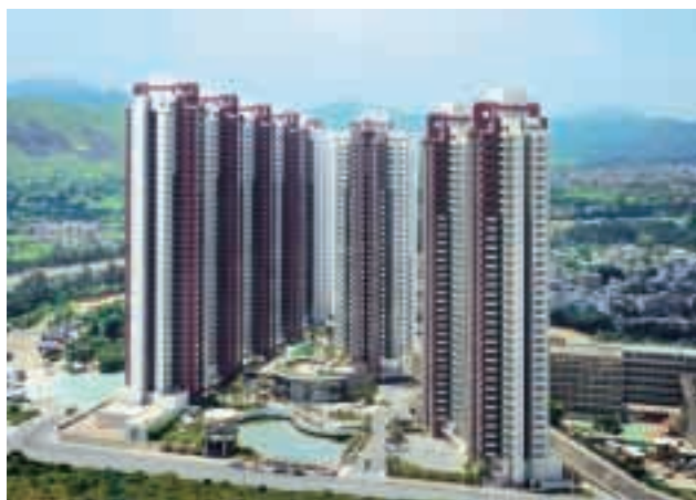
Yuen Long Town Lot 504 is an extension of YOHO Town, the Group's vibrant young community in Yuen Long.