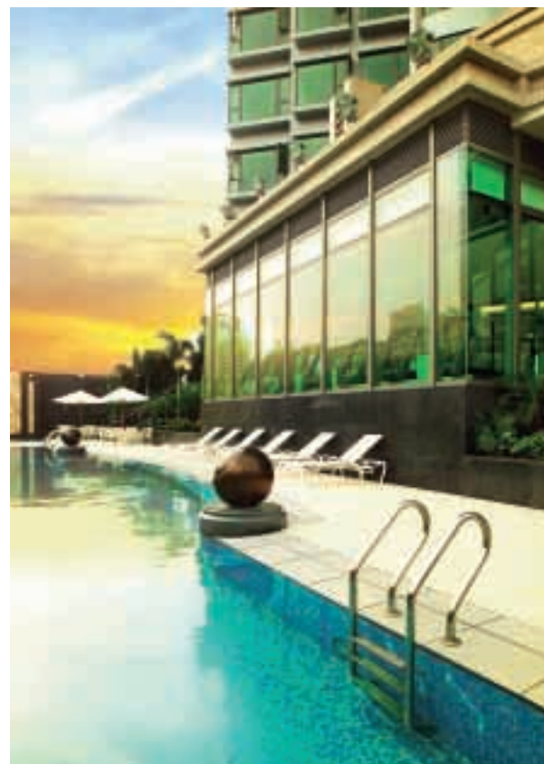
18 Farm Road in Ho Man Tin exudes grandeur and elegance.