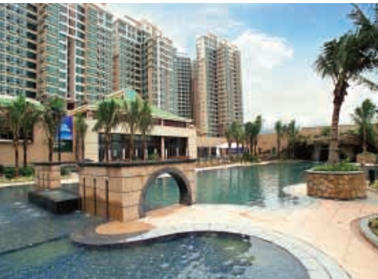
Park Island is an idyllic development on scenic Ma Wan.