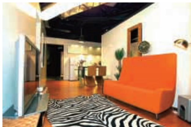
Elegant interiors at 8 Waterloo Road offer quality living in Kowloon.