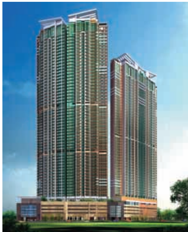
Chelsea Court in Tsuen Wan is a six-star hotel residence with over 1,600 units.

This project in the northern New Territories will offer residents easy transport connections north to the Mainland and south to urban Kowloon. This is the finest development planned for the district over the next few years. Construction of the superstructure began recently.